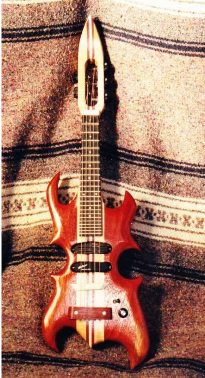
Heavy Metal Electric Mandolin to Customer's Design Padouk and Maple