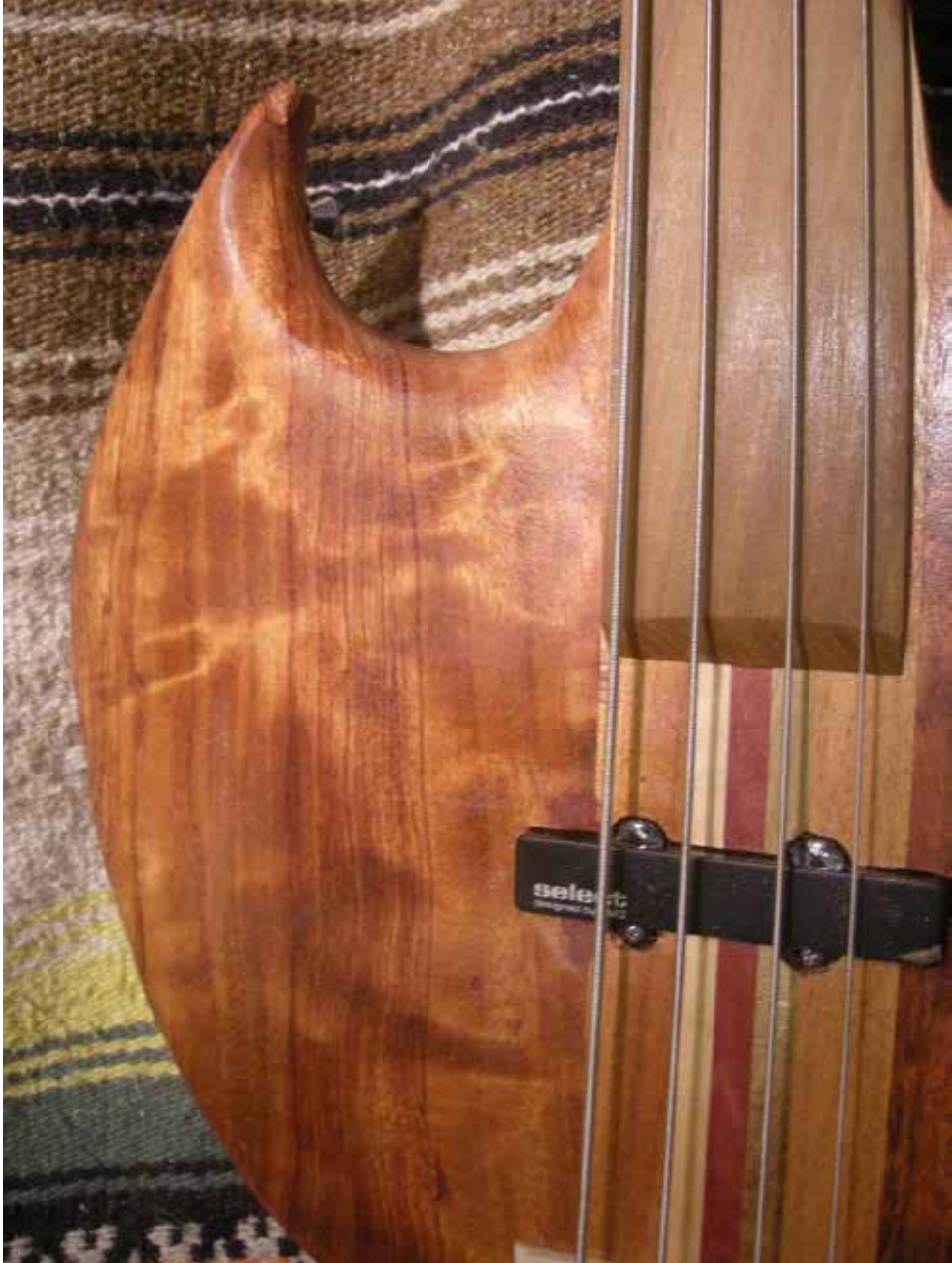
Curly Cherry Moon Bass