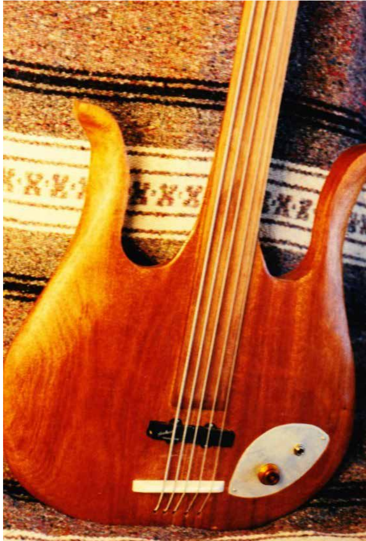
Mahogany Longhorn Bass