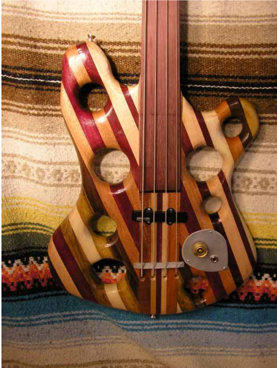
The Holy Scroll Bass