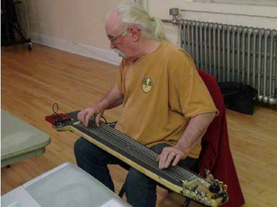
Me Demonstrating the Quinn