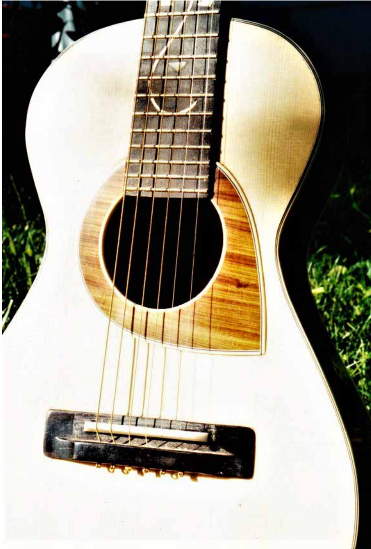
Inlaid Parlor Guitar