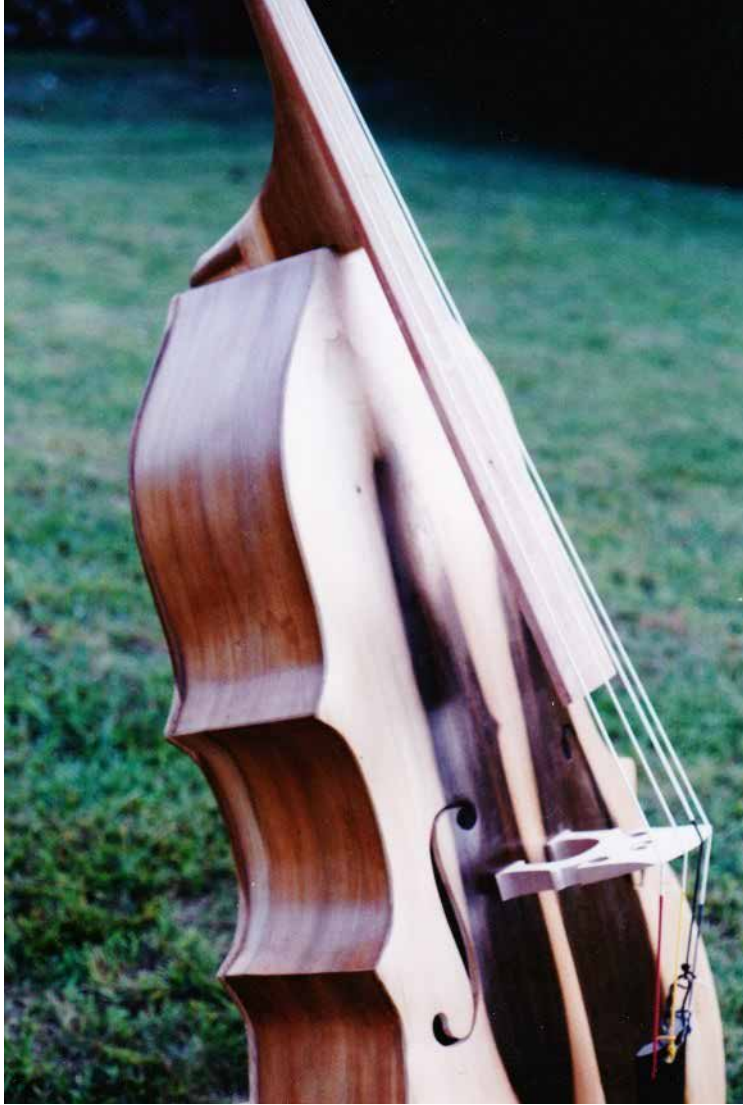
As Above, Side View