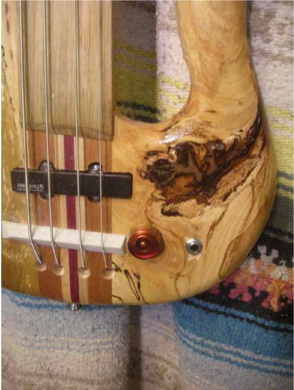
Ambrosia Maple Stude