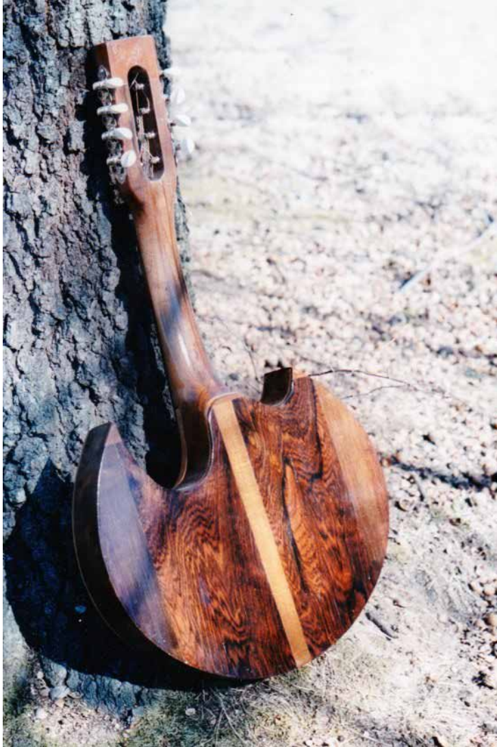
Back of Rosewood Moon Mandolin