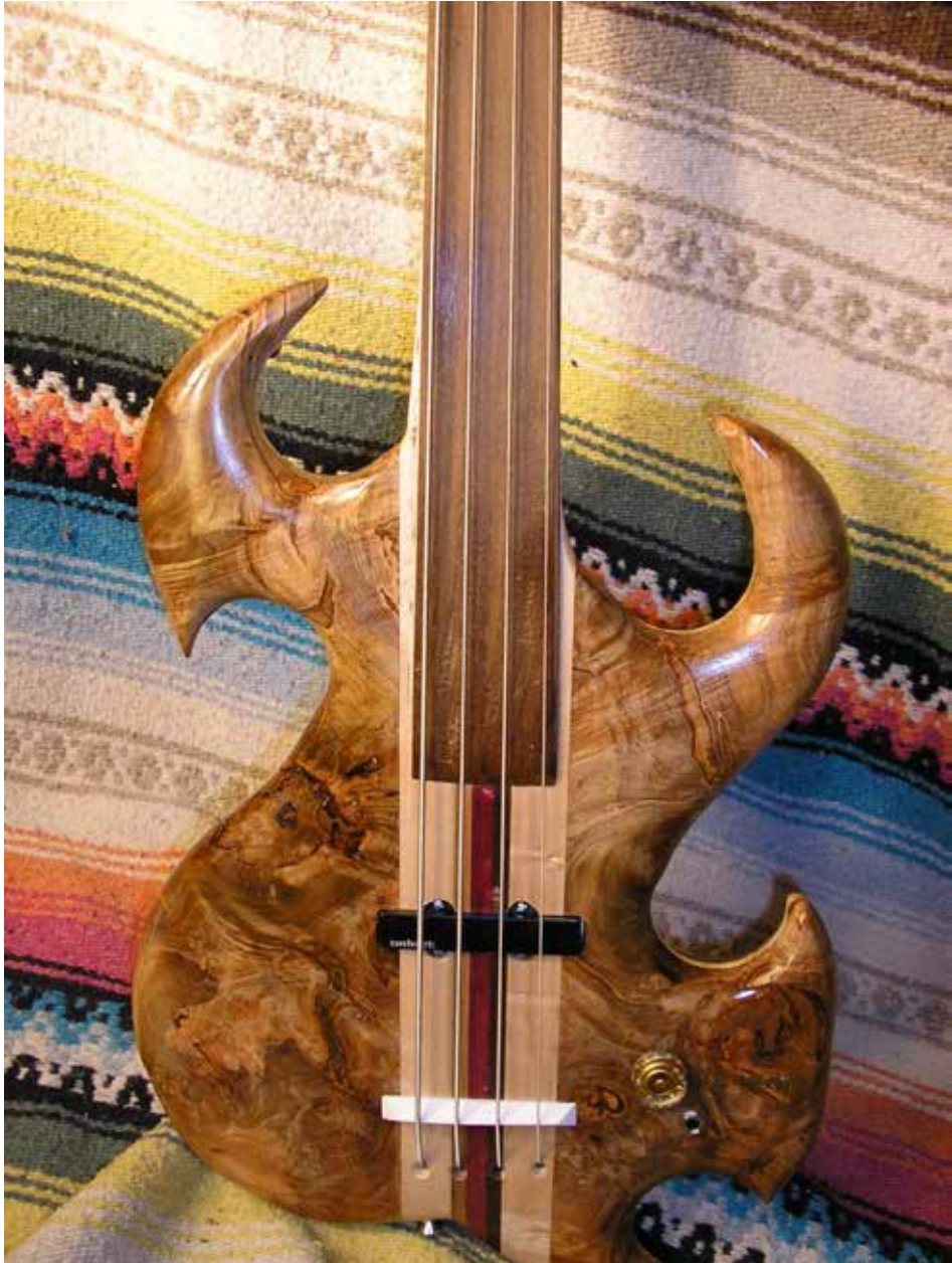
Highly Figured Maple Swirl Bass