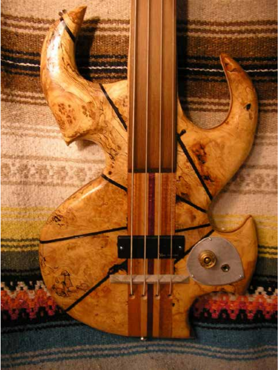
Ambrosia Maple Motley Swirl Bass