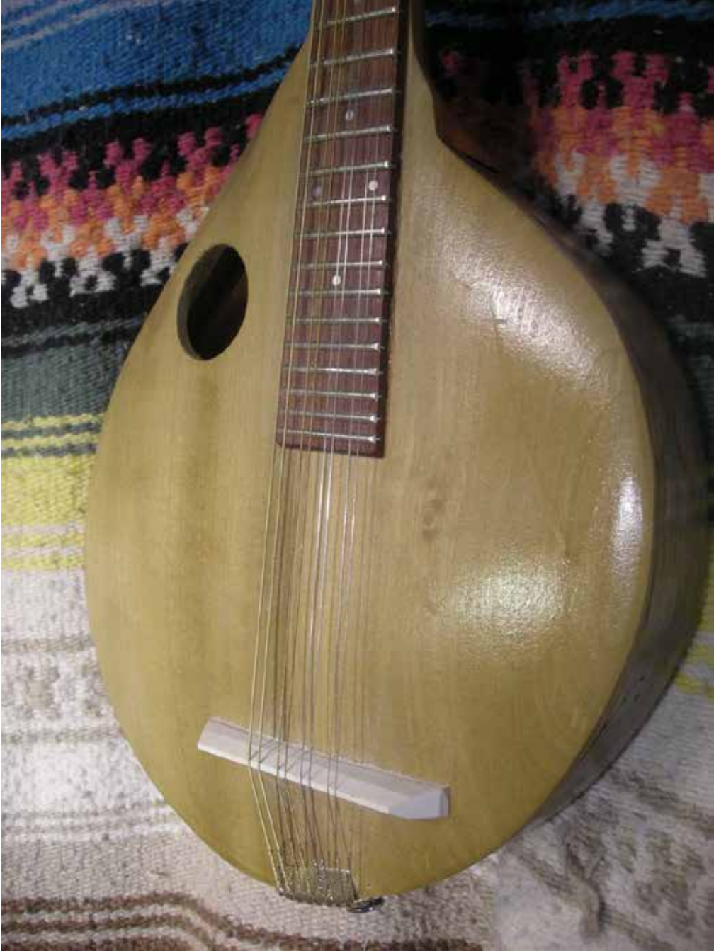
Old Growth Poplar Mandolin