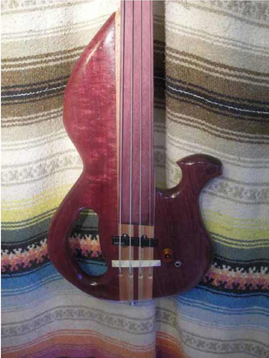
Curly Purpleheart X-Lobe