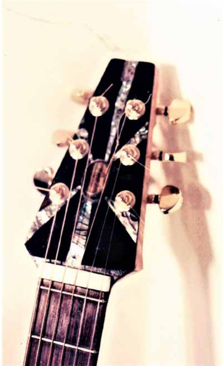
Inlaid Peghead Jazzer