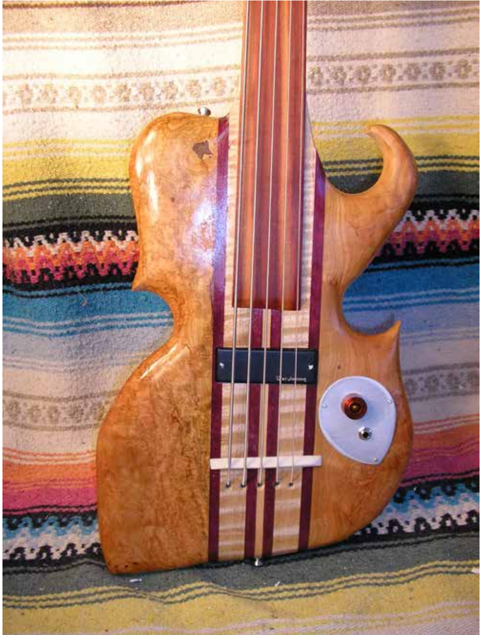
Standard Variant in Quilted Cherry