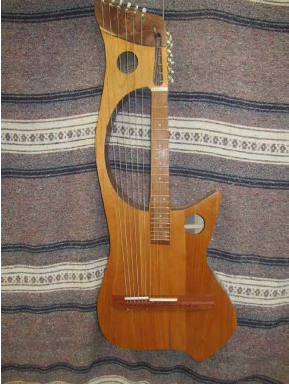
More Recent Harp Guitar