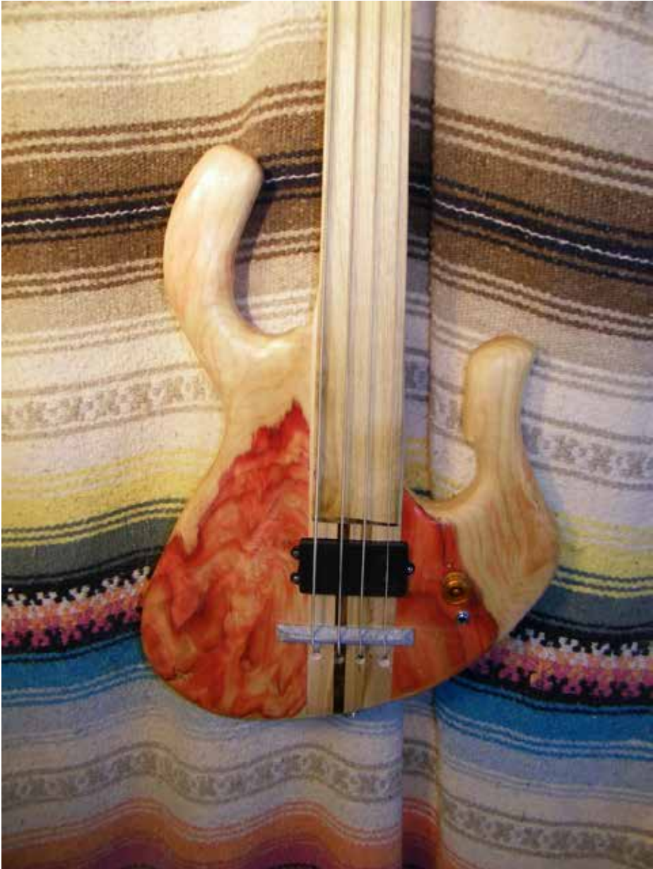
Box Eldar Stude