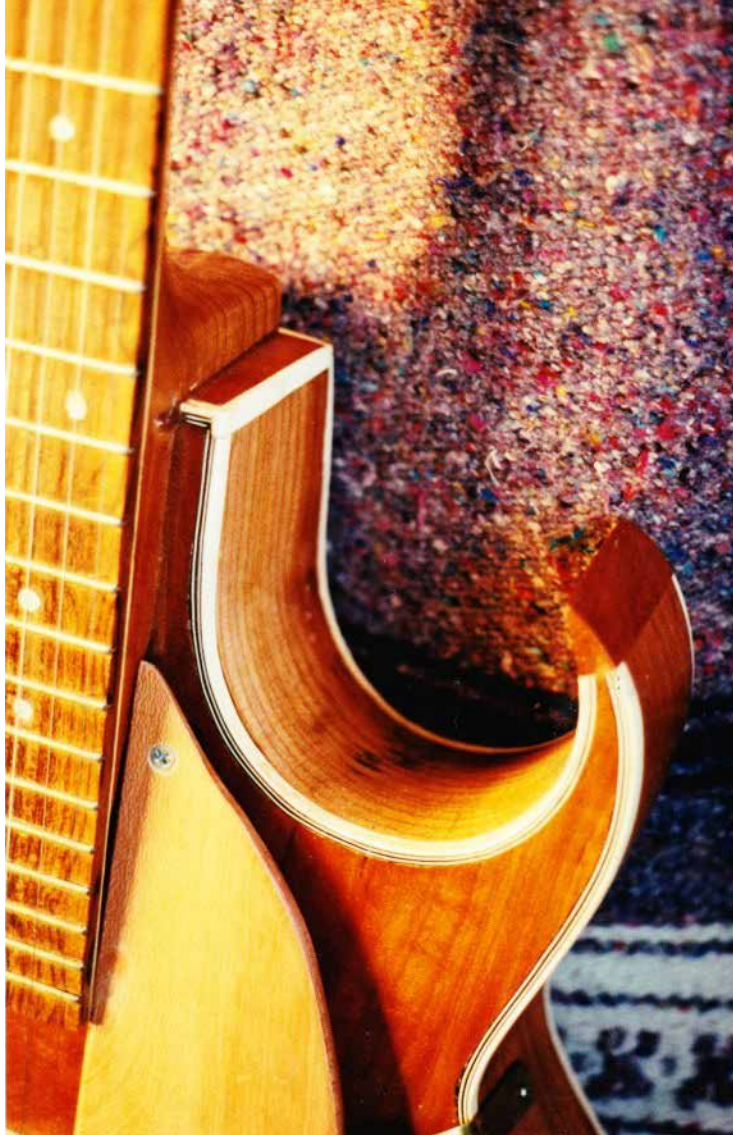
Detail of Cherry Jazzer