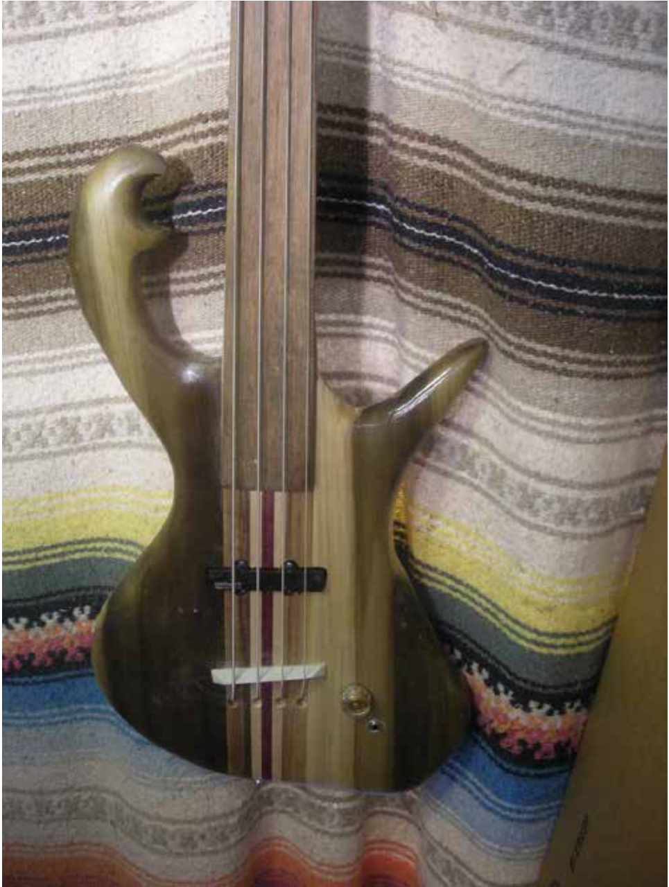
Old Poplar Claw