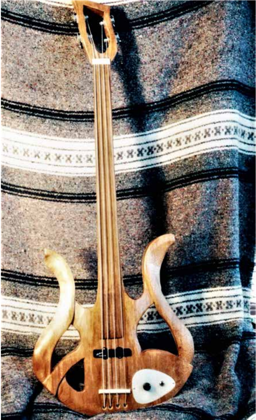
Unique Maple Pre-Wishbass