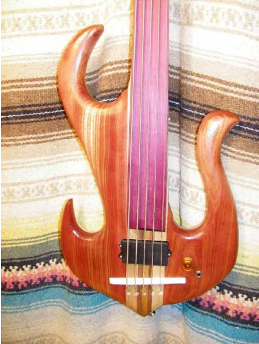
Red Cedar Fantasy