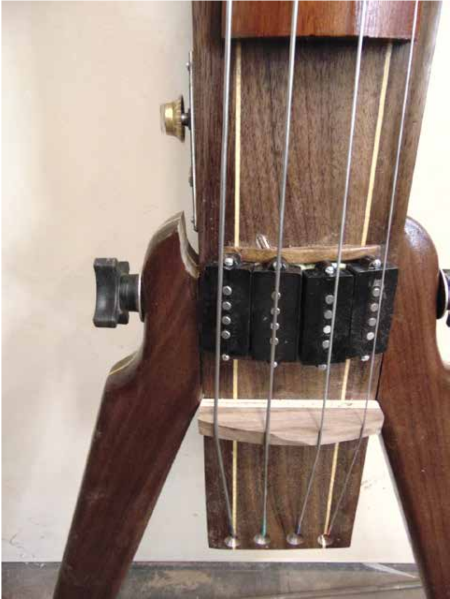
Pickup Configuration, Vee EUB