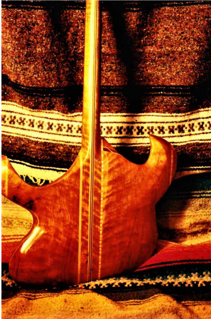
Curly Cherry Unique Bass