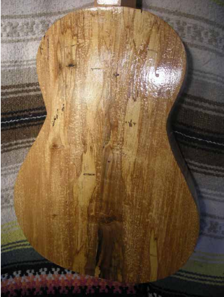
Spaulted Maple Parlor Guitar