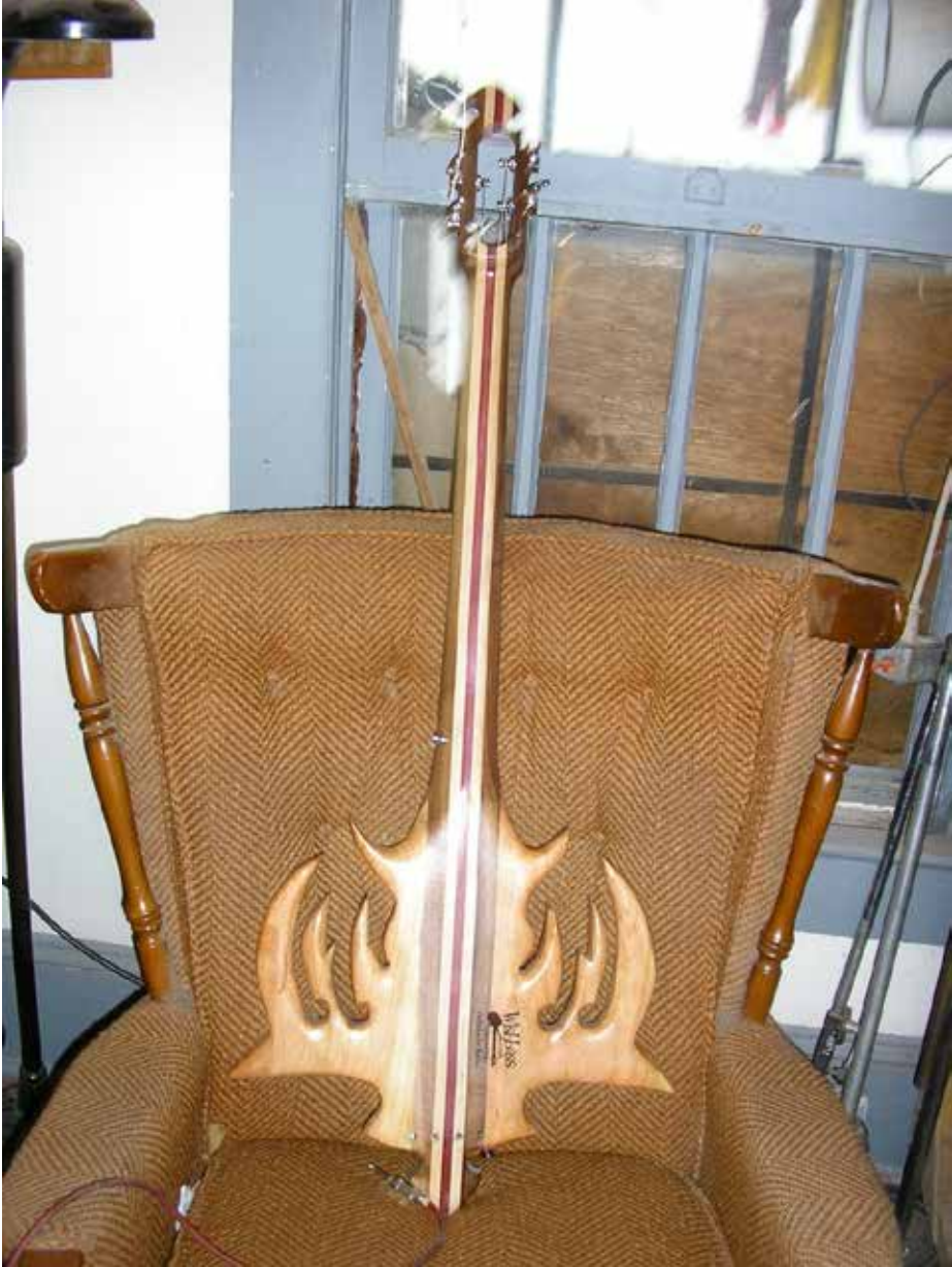
The Wildest Customer Design Yet