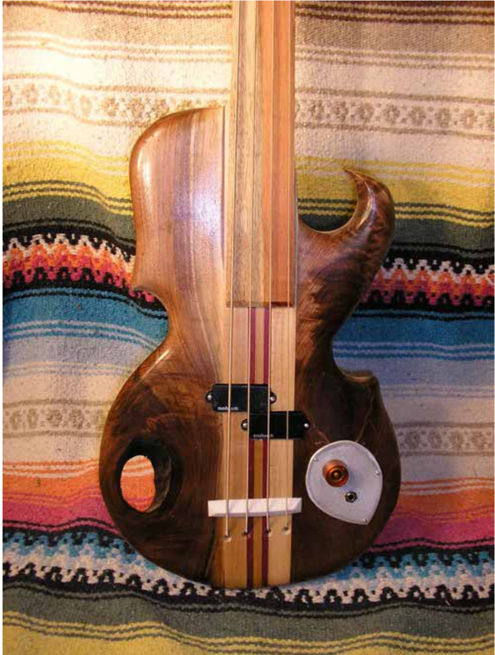
Walnut Standard Bass