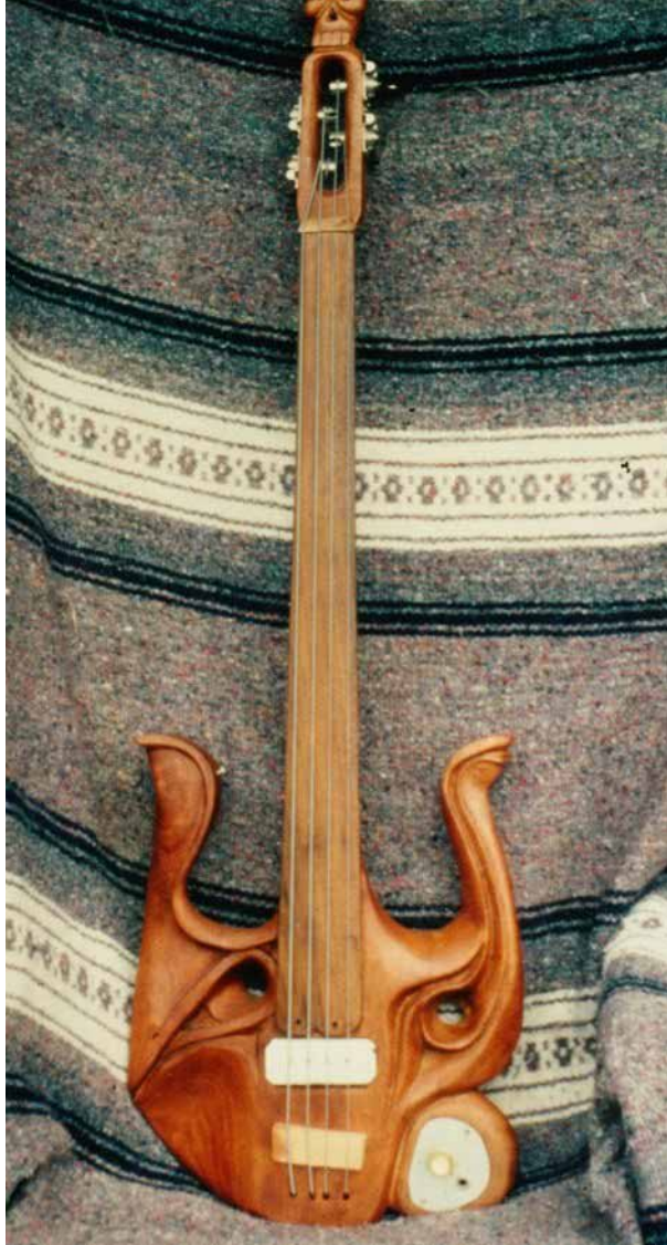
Front of Ace of Diamonds Bass