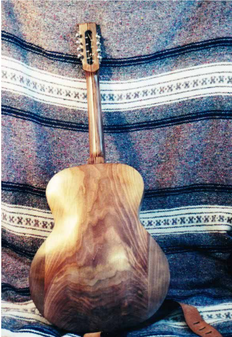
Walnut Back Archtop Mandocello