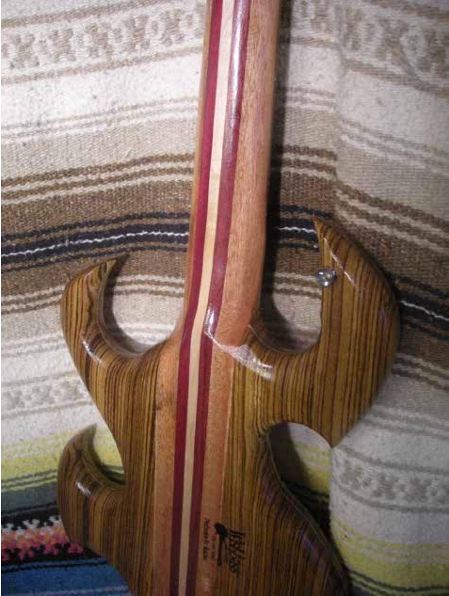
Zebra wood Swirl