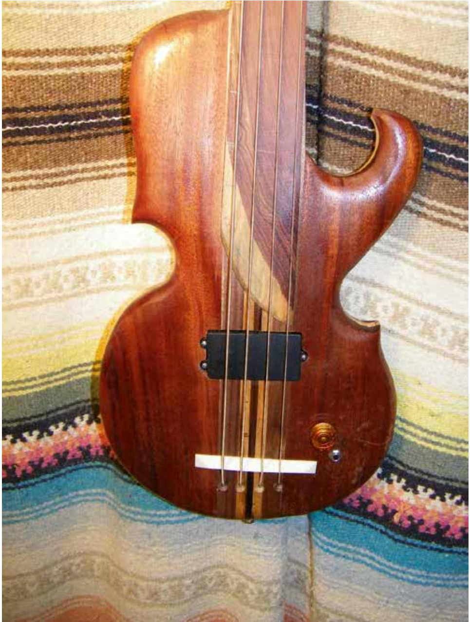
Bloodwood Standard Bass