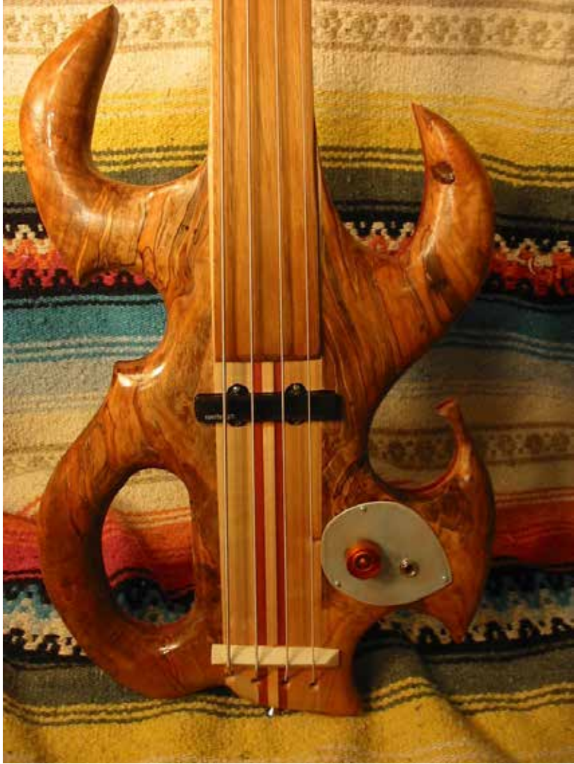
Figured Maple Swirl Bass