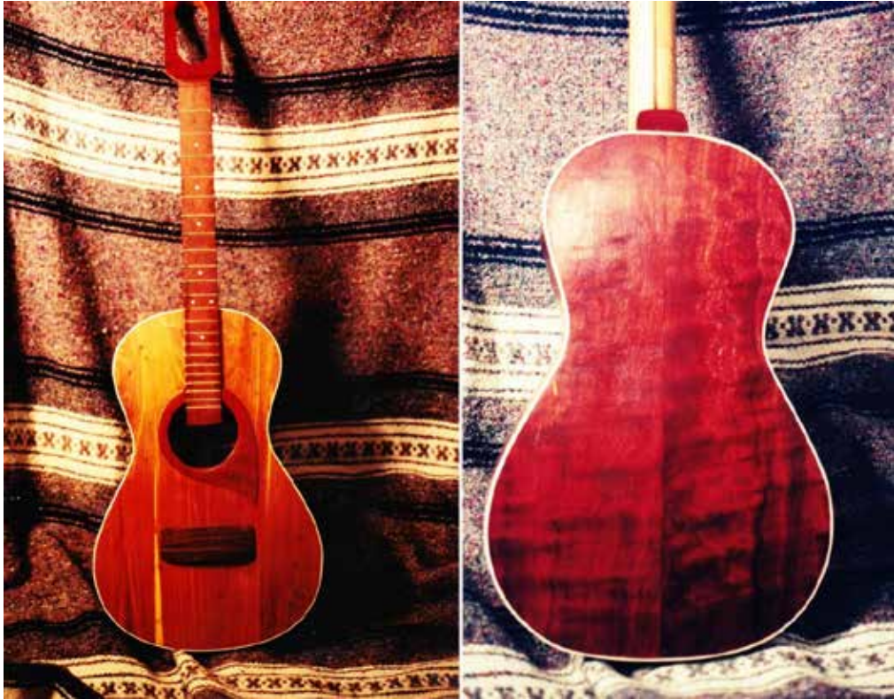
Front and Back of Cedar and Curly Bloodwood Parlor Tenor Guitar