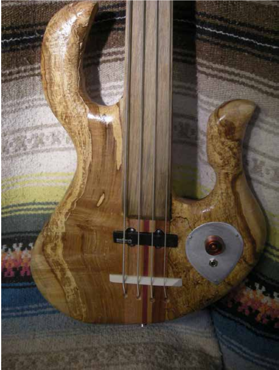
Spaulted Maple Stude