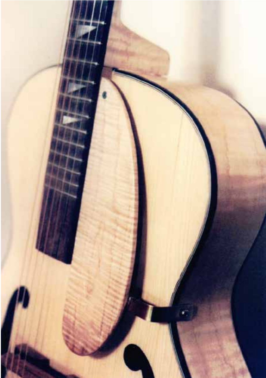
Curly Maple Jazzer, as Above