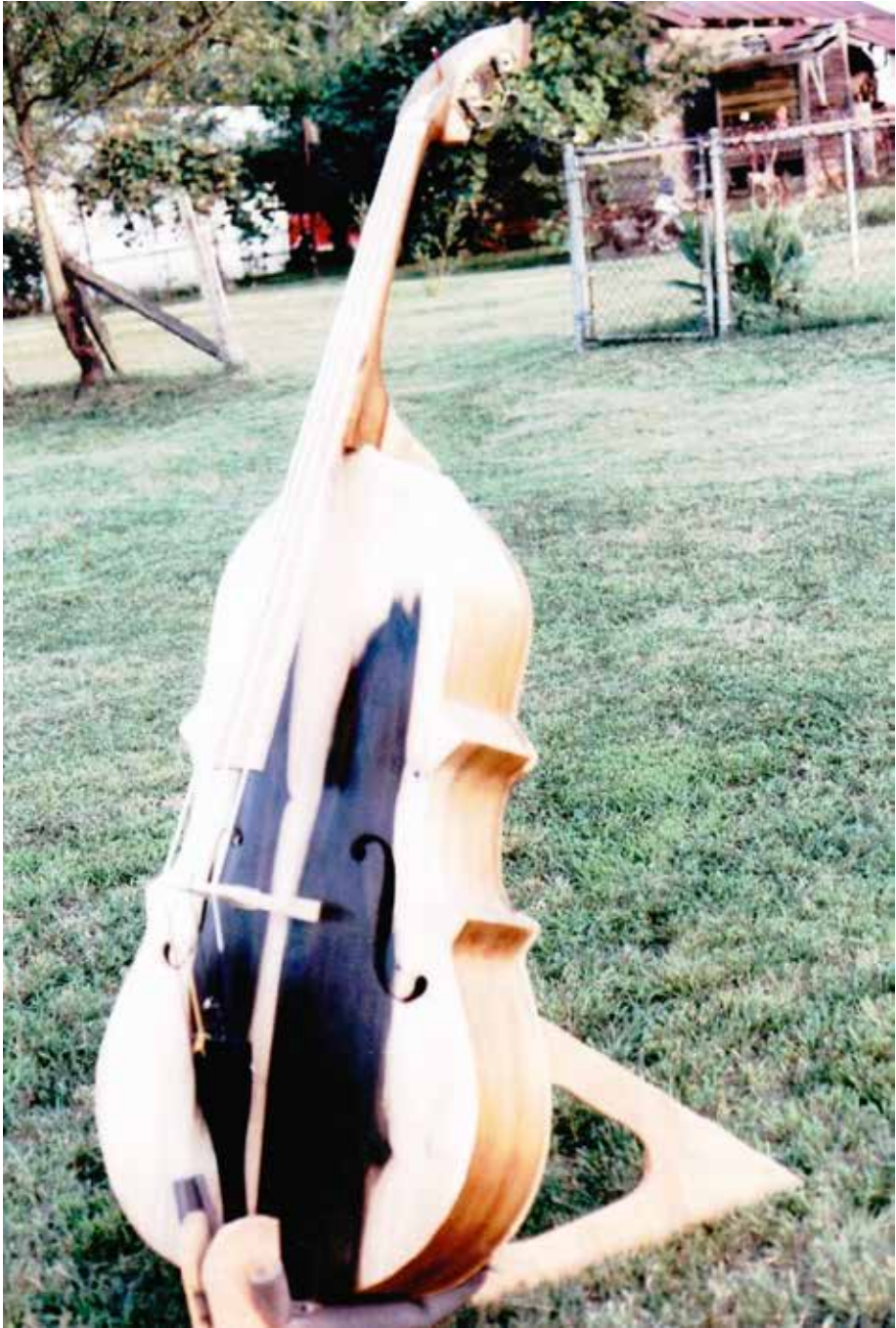
Poplar Top Upright