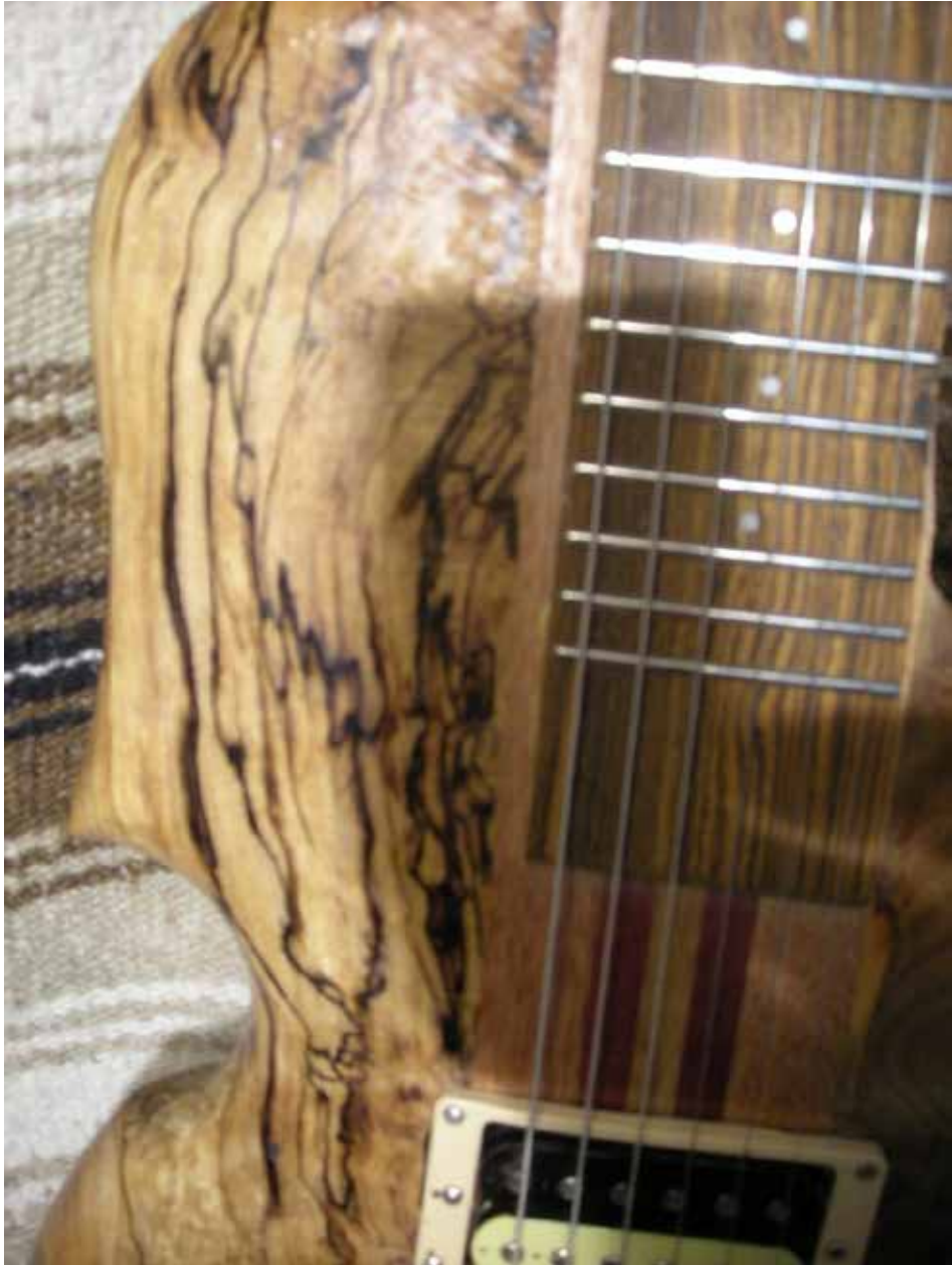
Spalted Maple Standard Guitar