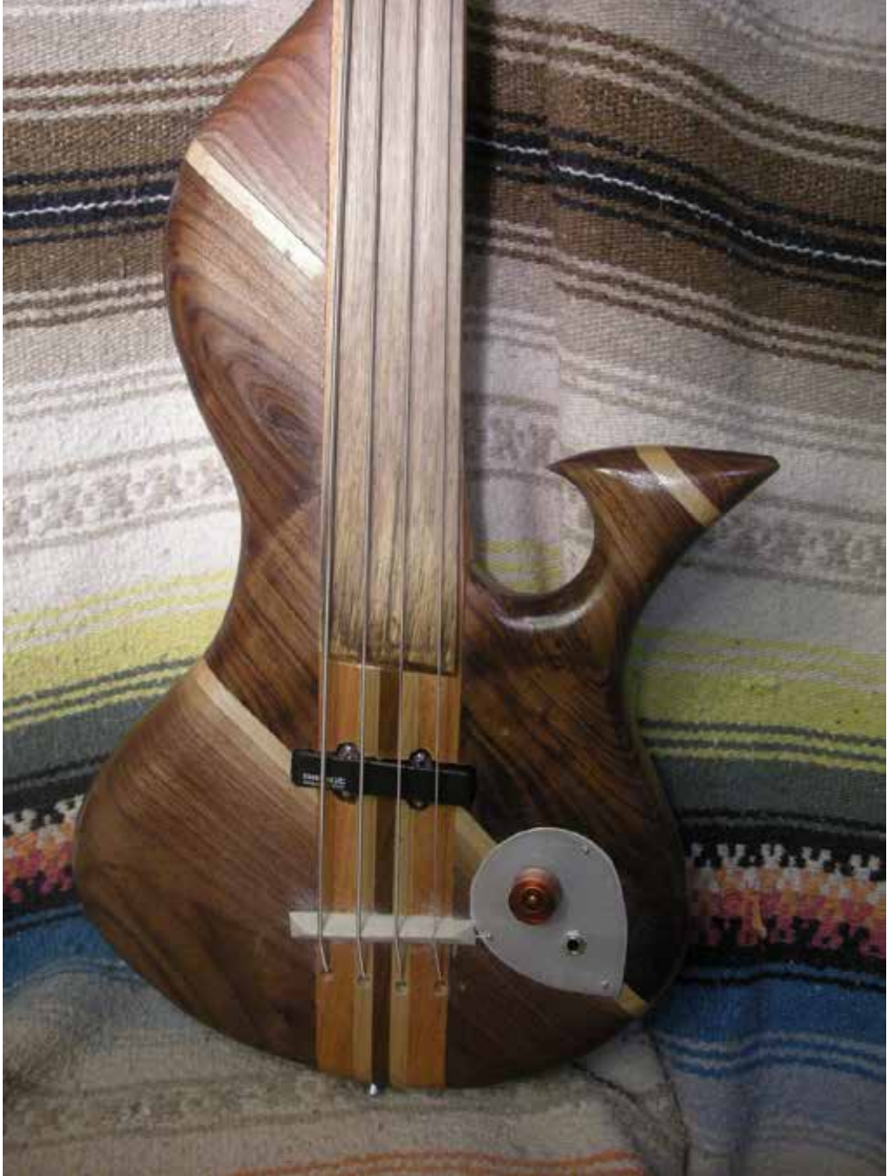
Striped Walnut Lobe