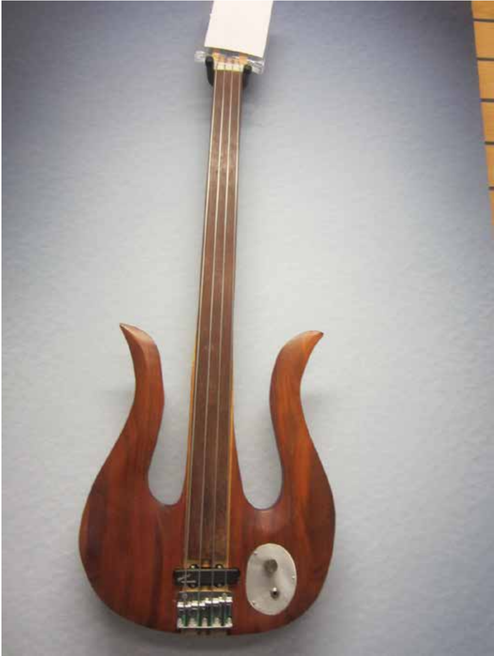
Goncolo Alves Super Longhorn