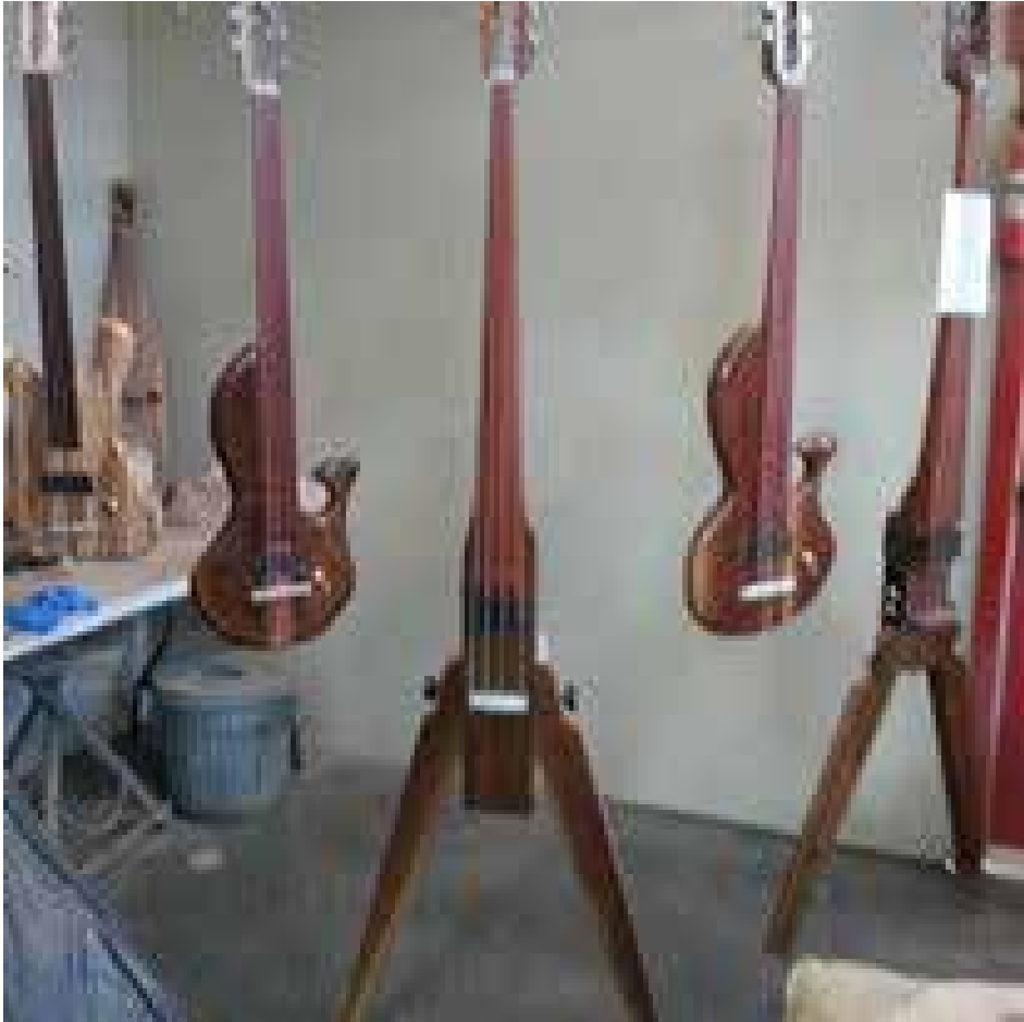
Finishing Corner in New Shop