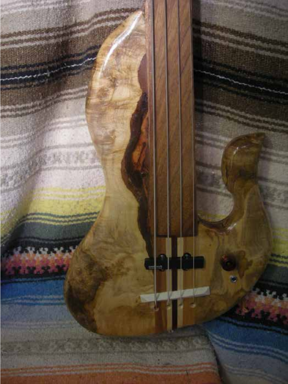
Ambrosia Maple Peanut