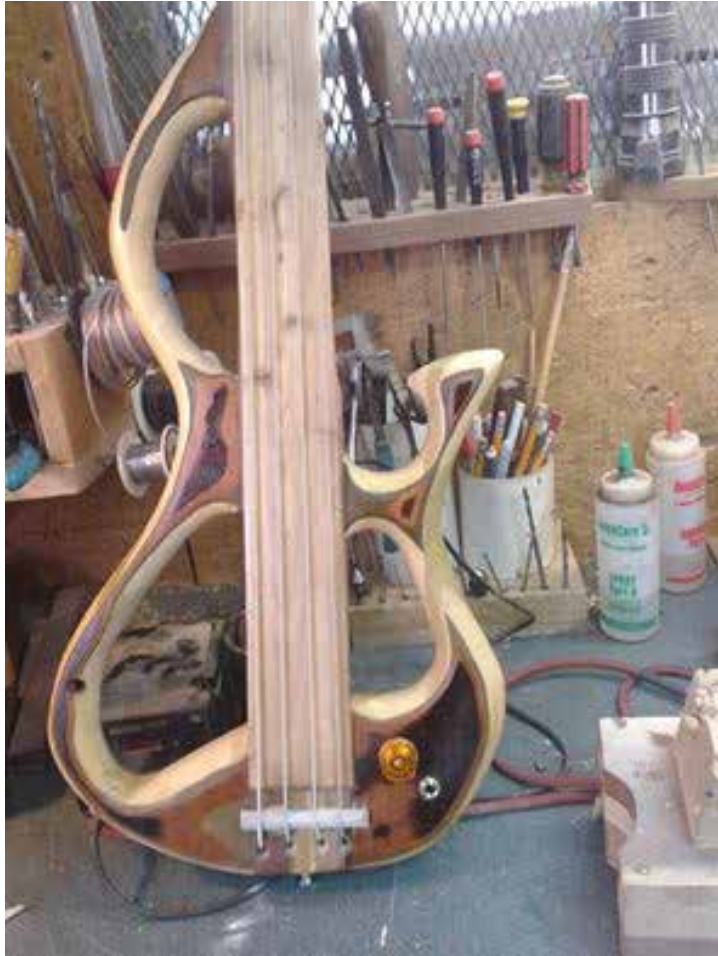
Piano Wood X-Lobe on the Bench in the Old Shop