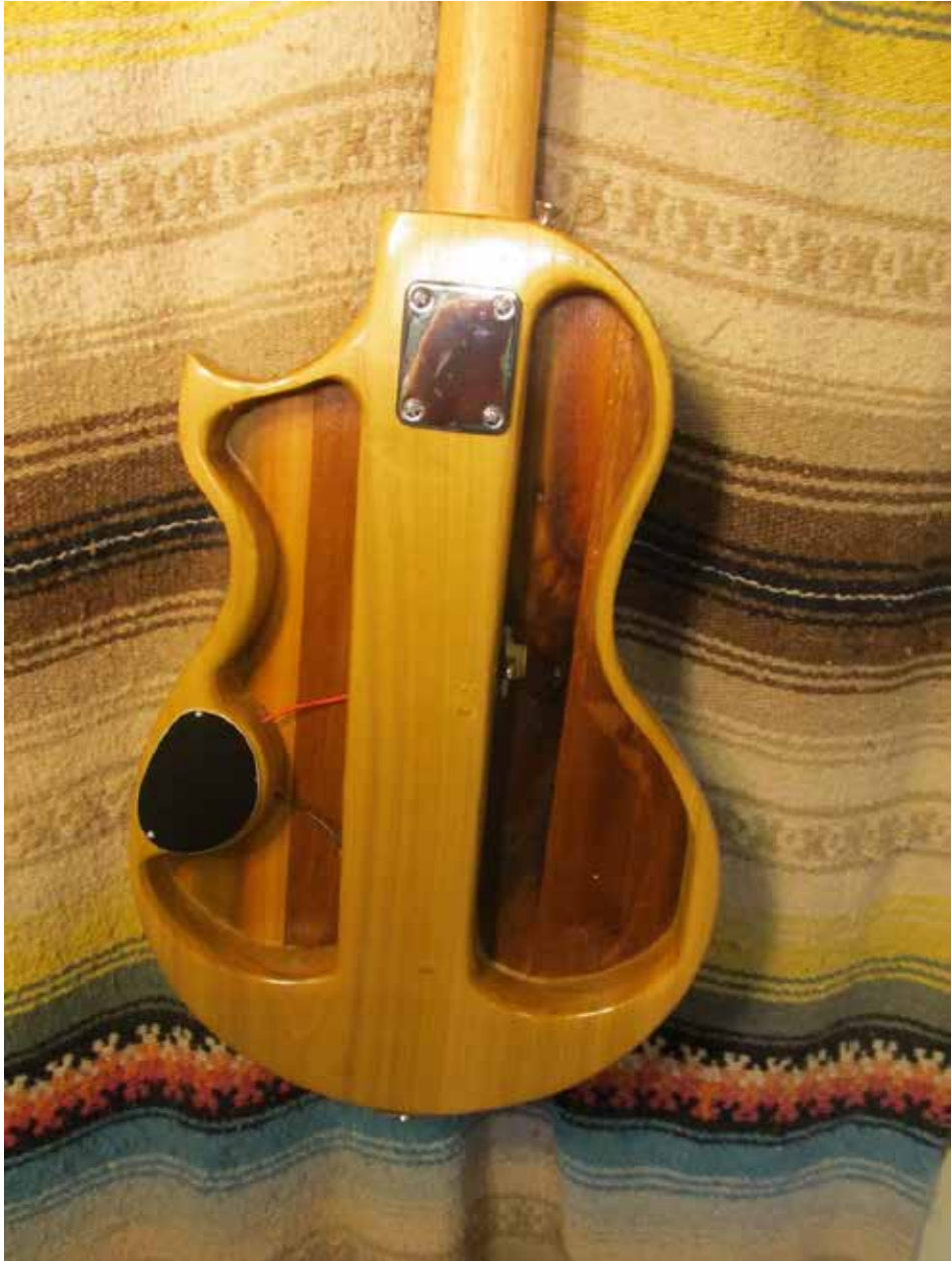
Back View of JJK Guitar