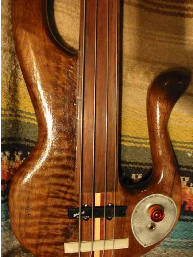
Curly Walnut Custom