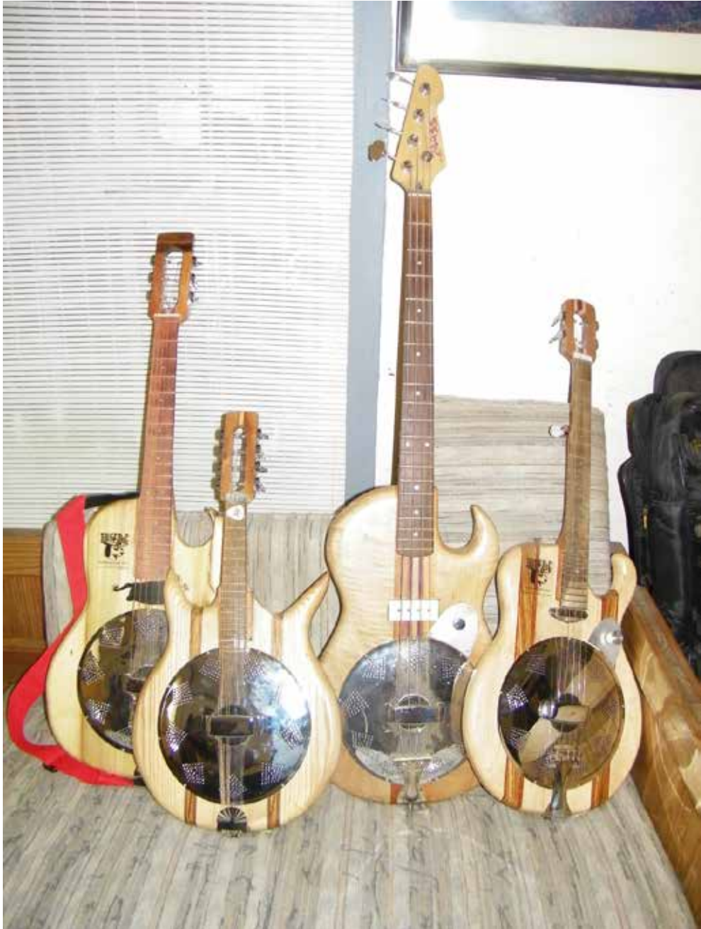
First Batch of Resnos from Shopbot