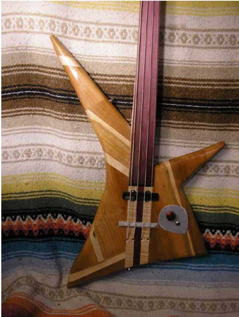
Motley Cong Kind Bass