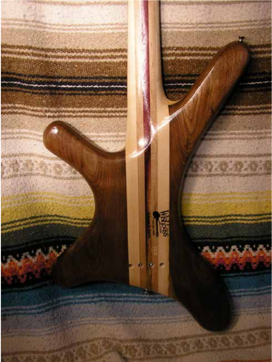
Walnut Kewel Bass