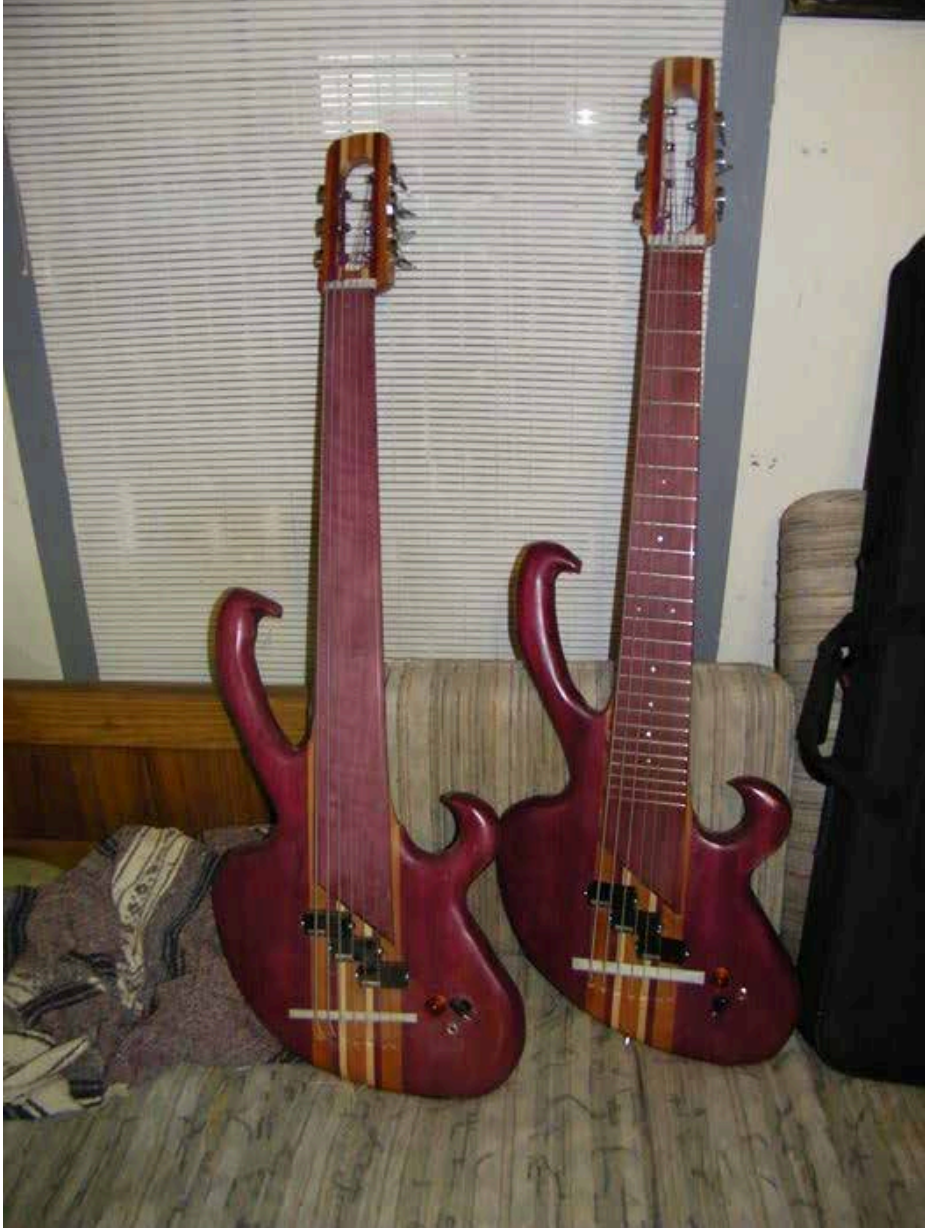
Matched Pair of Purpleheart Hipper Seven Strings