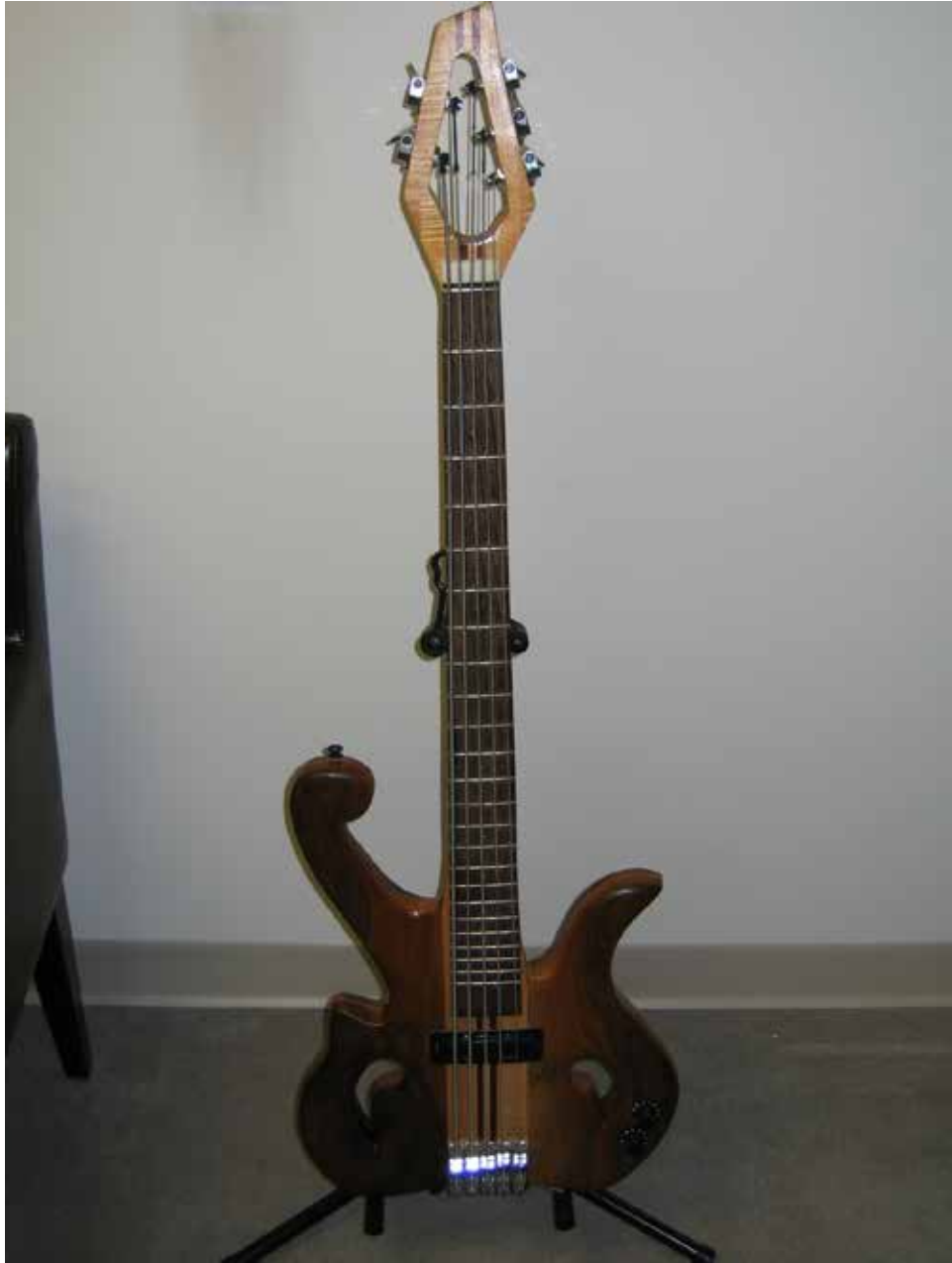
Unique Bass in Walnut