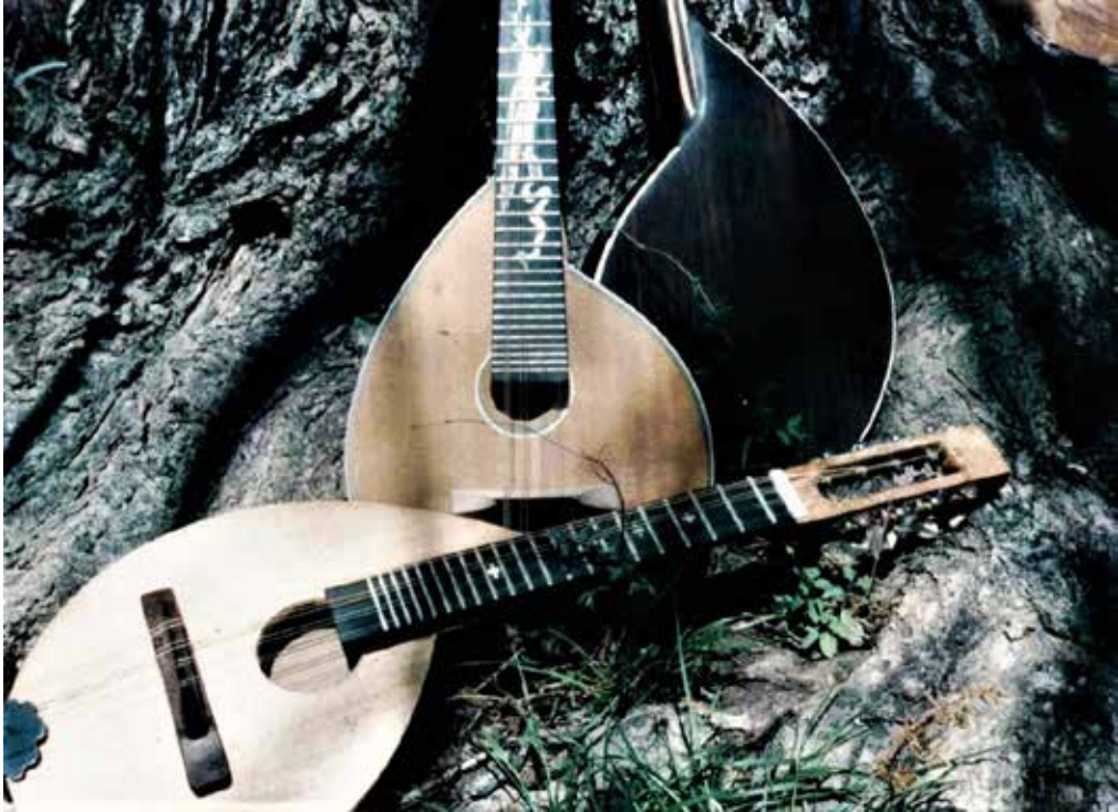
1985 Tennessee Mandolins