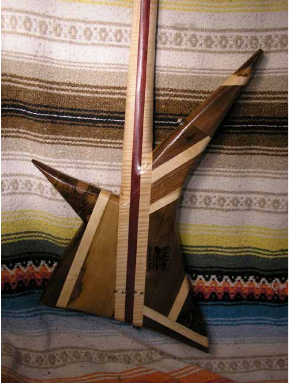
Back of Similar Bass