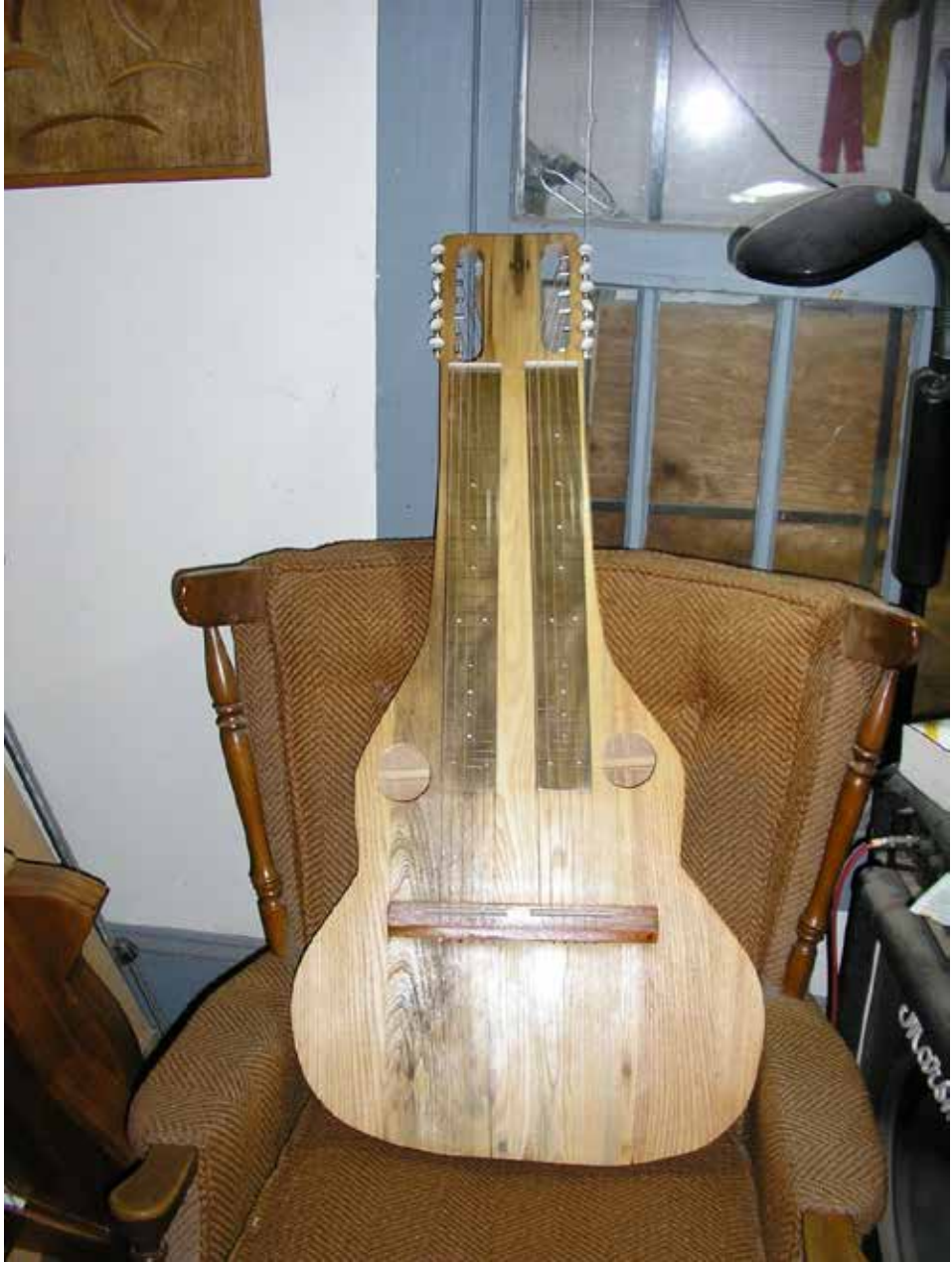
Chestnut Double Wishenbourne