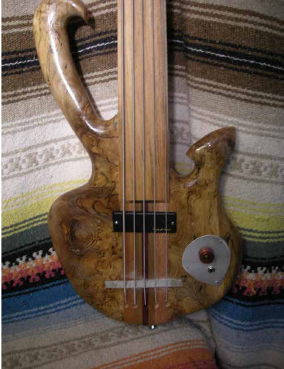
Ambrosia Maple Hipper