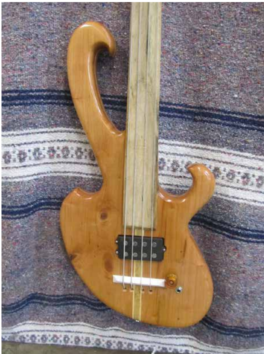
Pine Hipper Bass