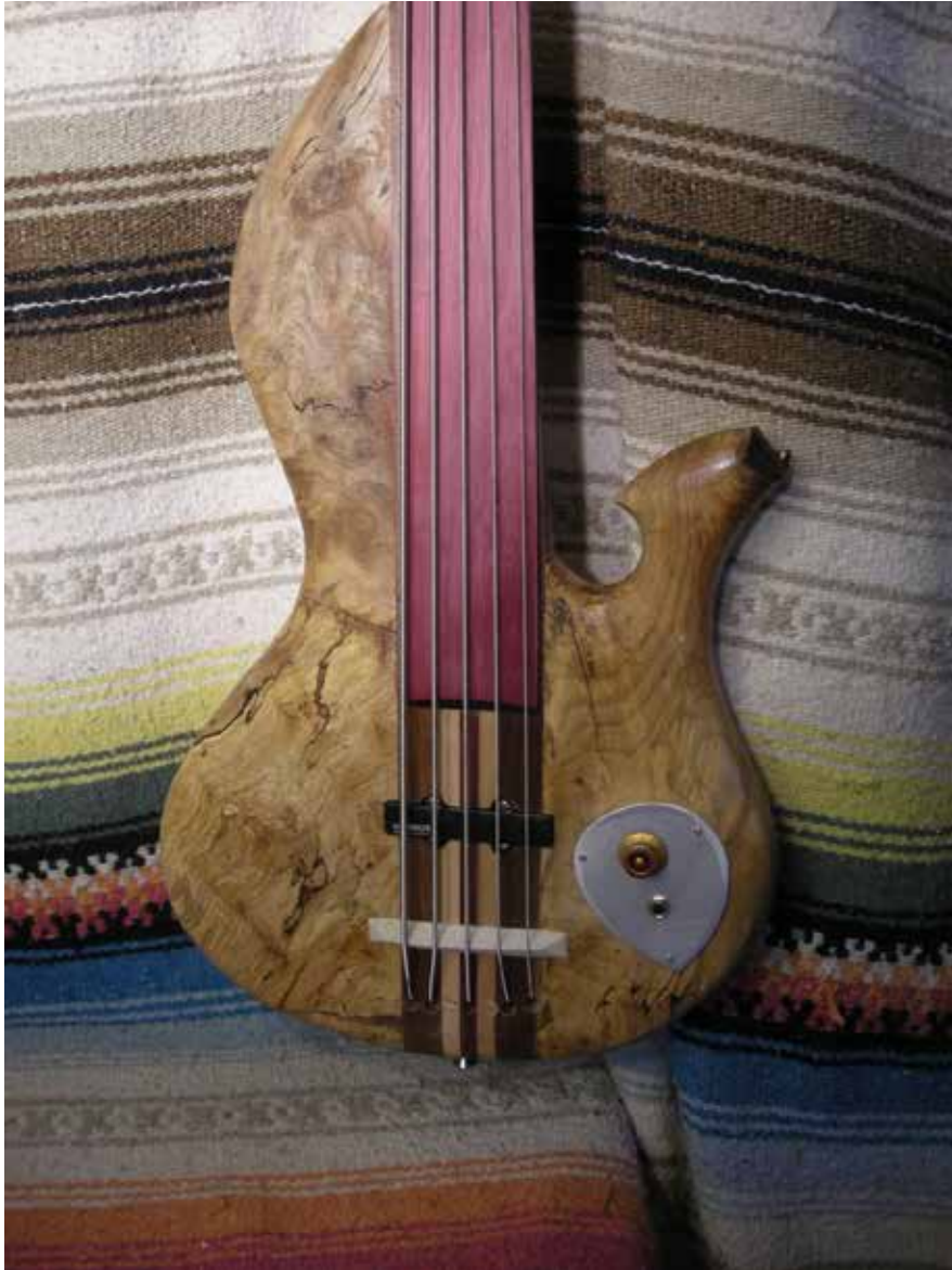
Spaulted Maple Lobe