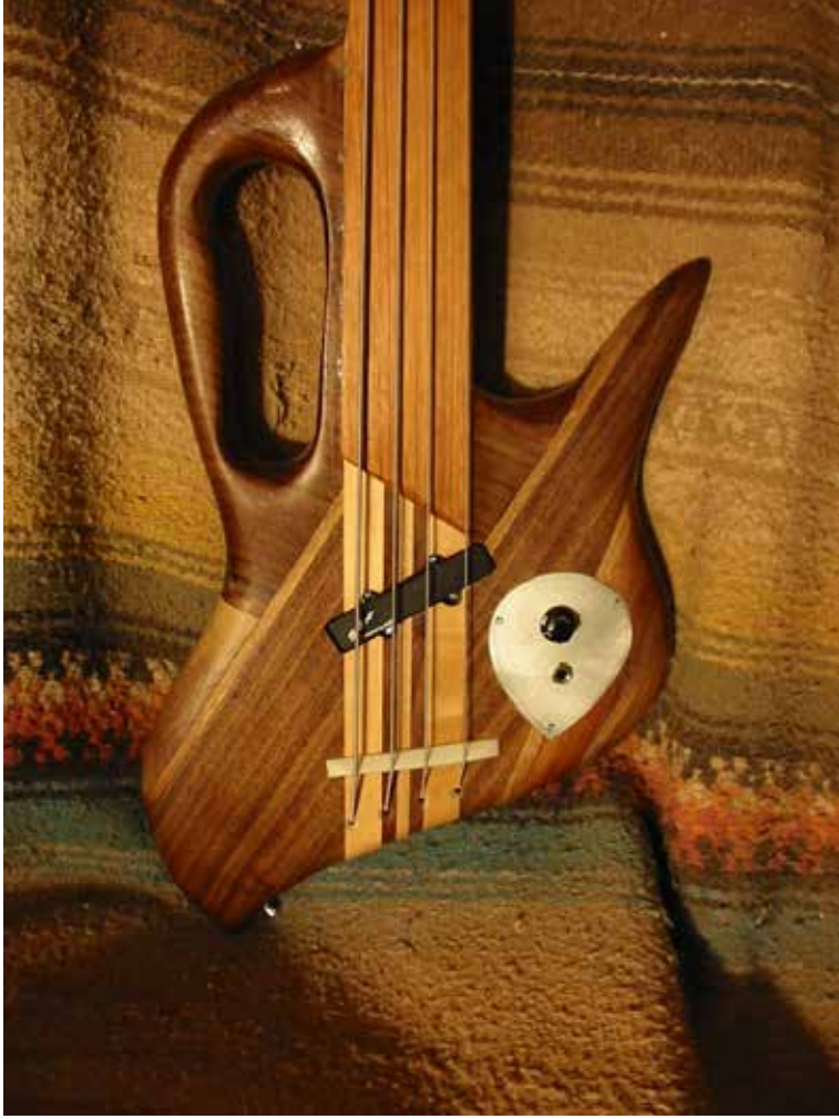
Motley One of a Kind Bass