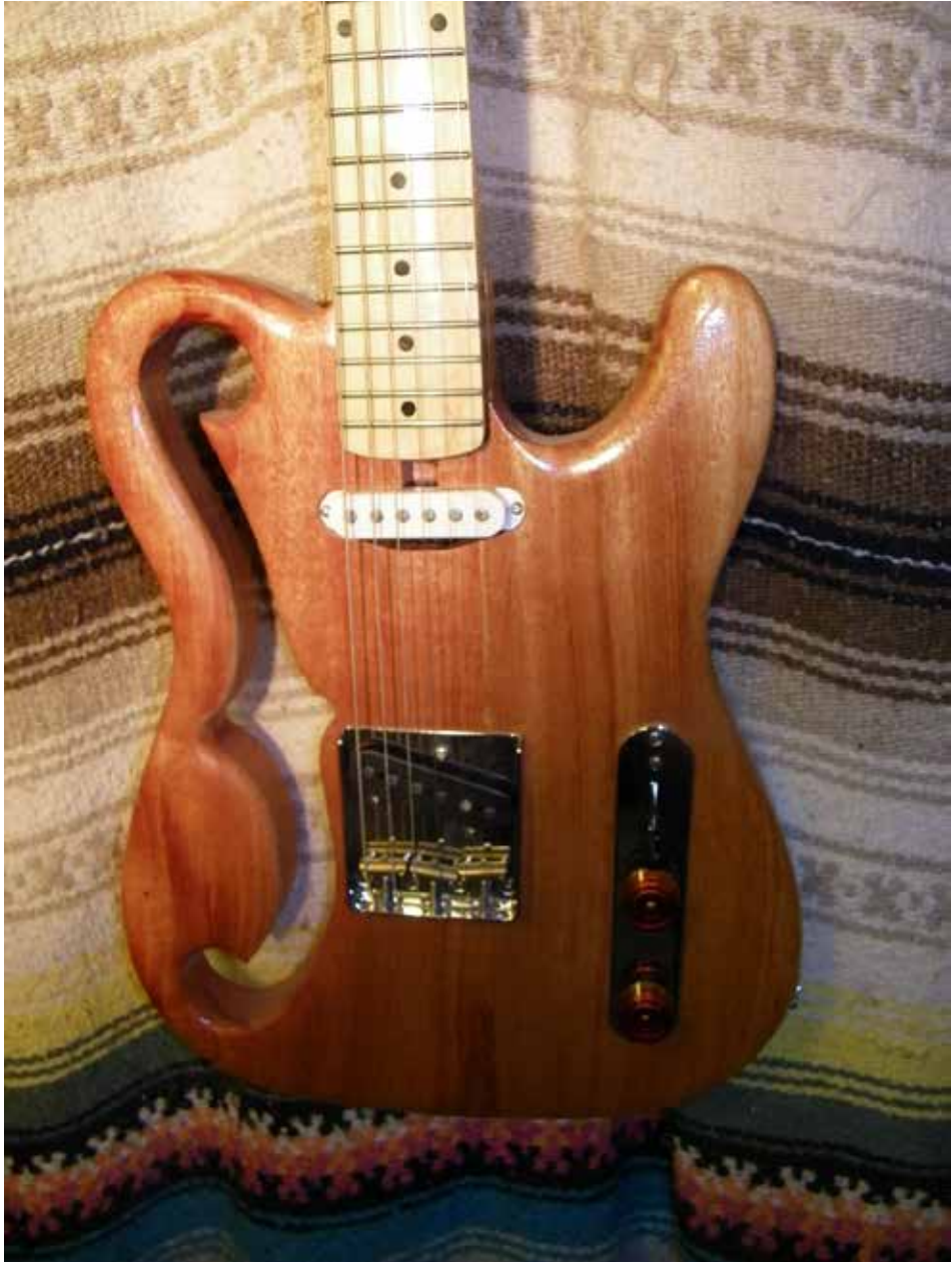
Mahogany Scroll Tele