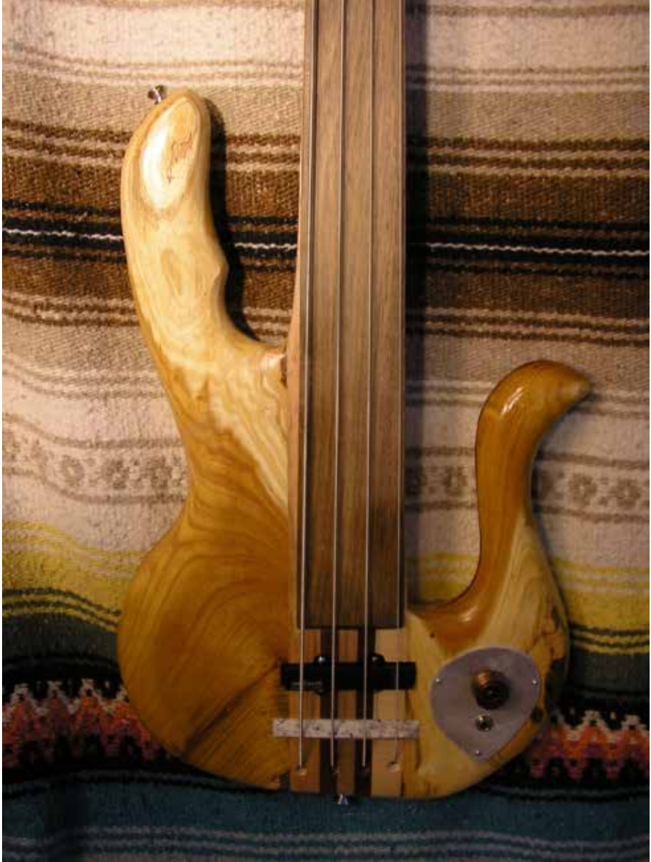
Mulberry Stude Bass