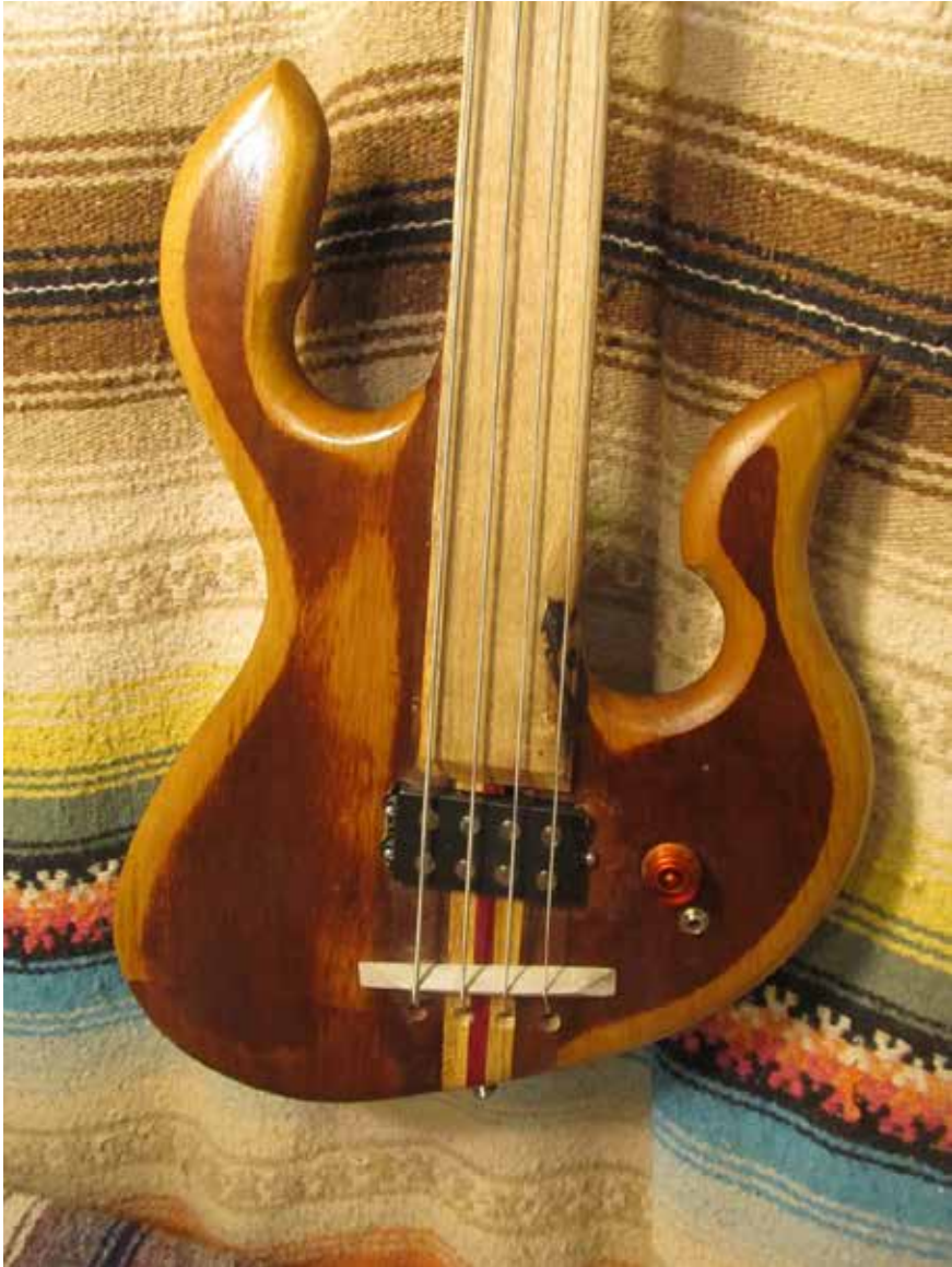
Piano Wood Stude