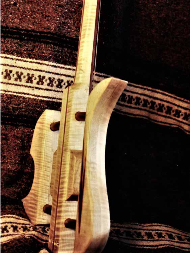
Curly Maple Outrigger Bass