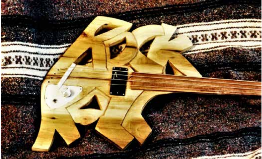
Poplar Carved Bass