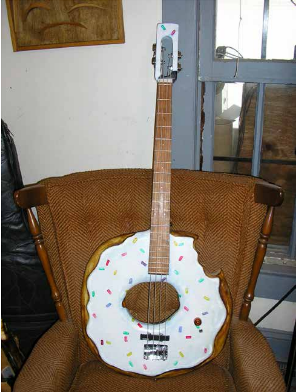
The Incredible Inedible Doughnut Bass