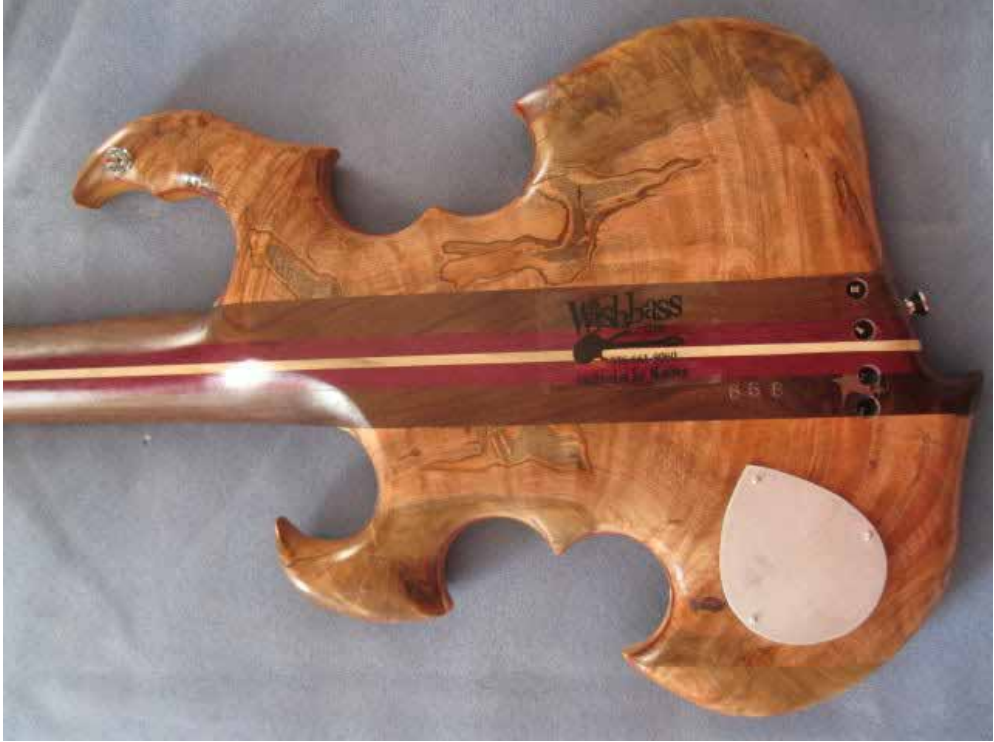
Ambrosia Maple Scarab Bass