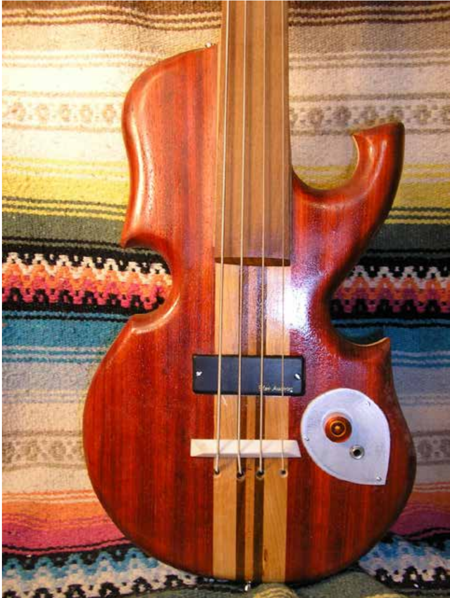
Striped Padouk Standard Bass