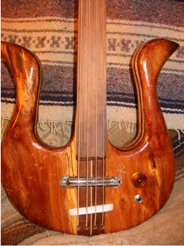
Cherry Super Longhorn