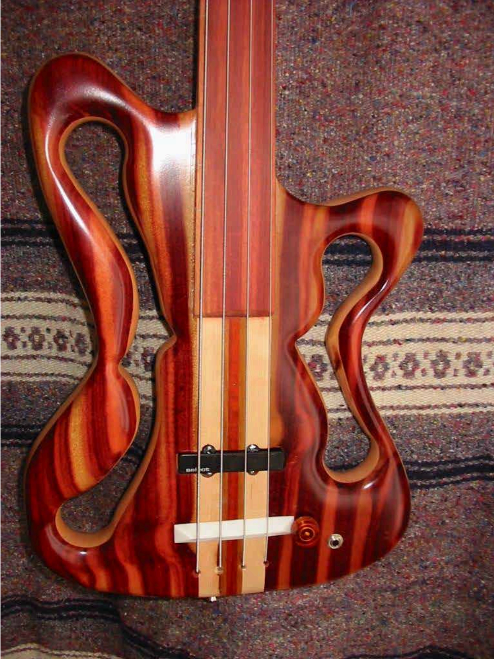
Striped Vermillion Scroll Bass