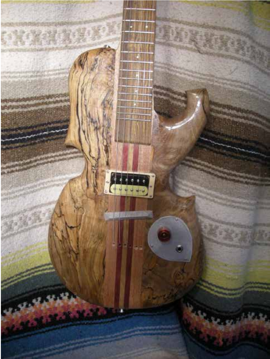
Ambrosia Maple Standard Guitar