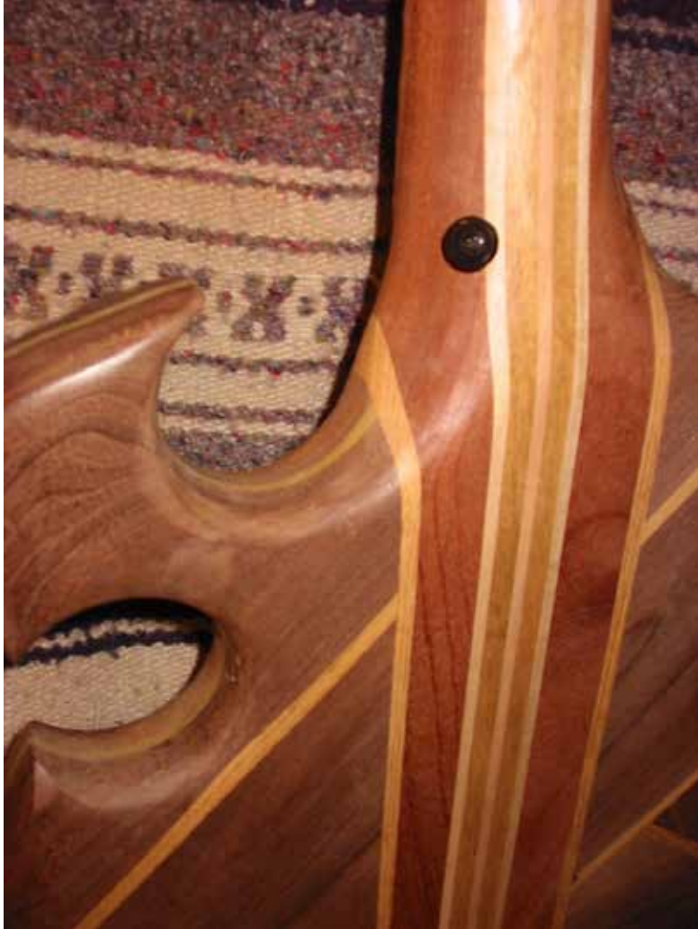
Back of Motley Scarab Bass