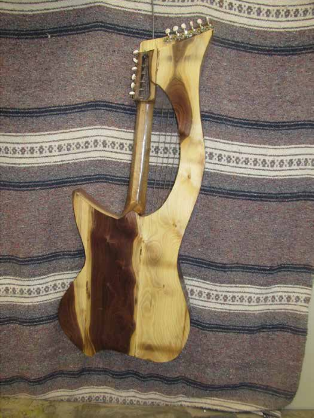
Walnut Harp Guitar