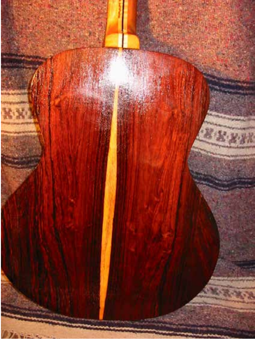
Rosewood Parlor Guitar