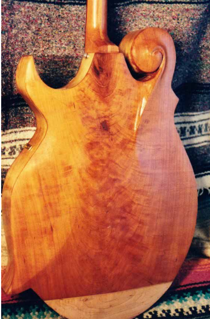
Back of Figured Cherry Mandocello