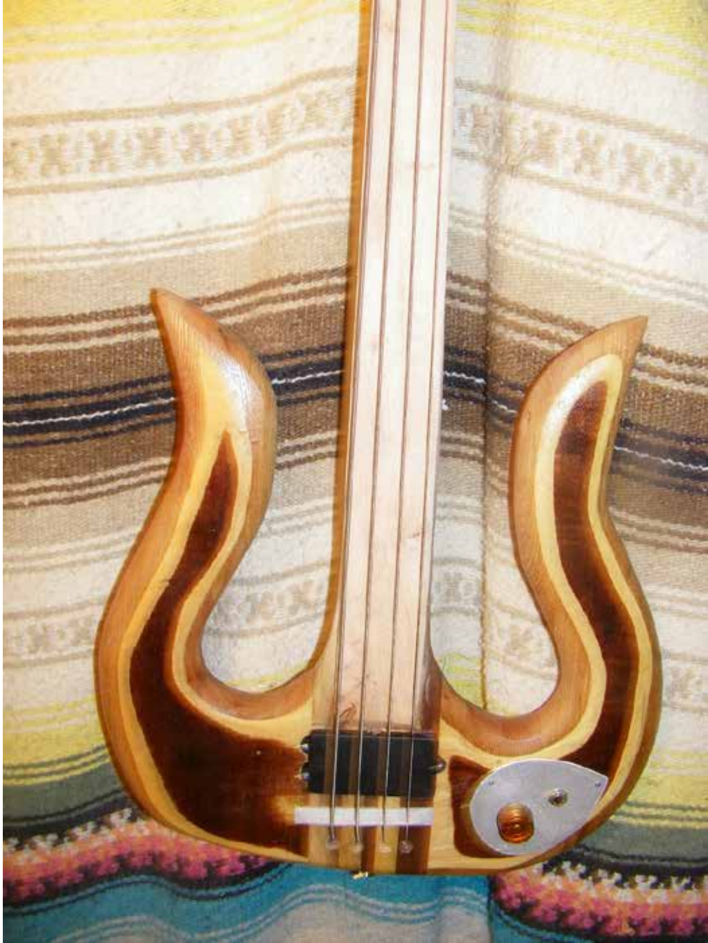
Super Longhorn from Piano Wood with Original Veneer and Finish