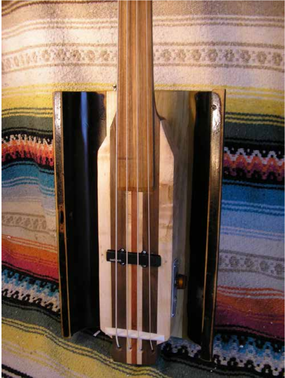
Bass Made from Piano Keyboard Cover