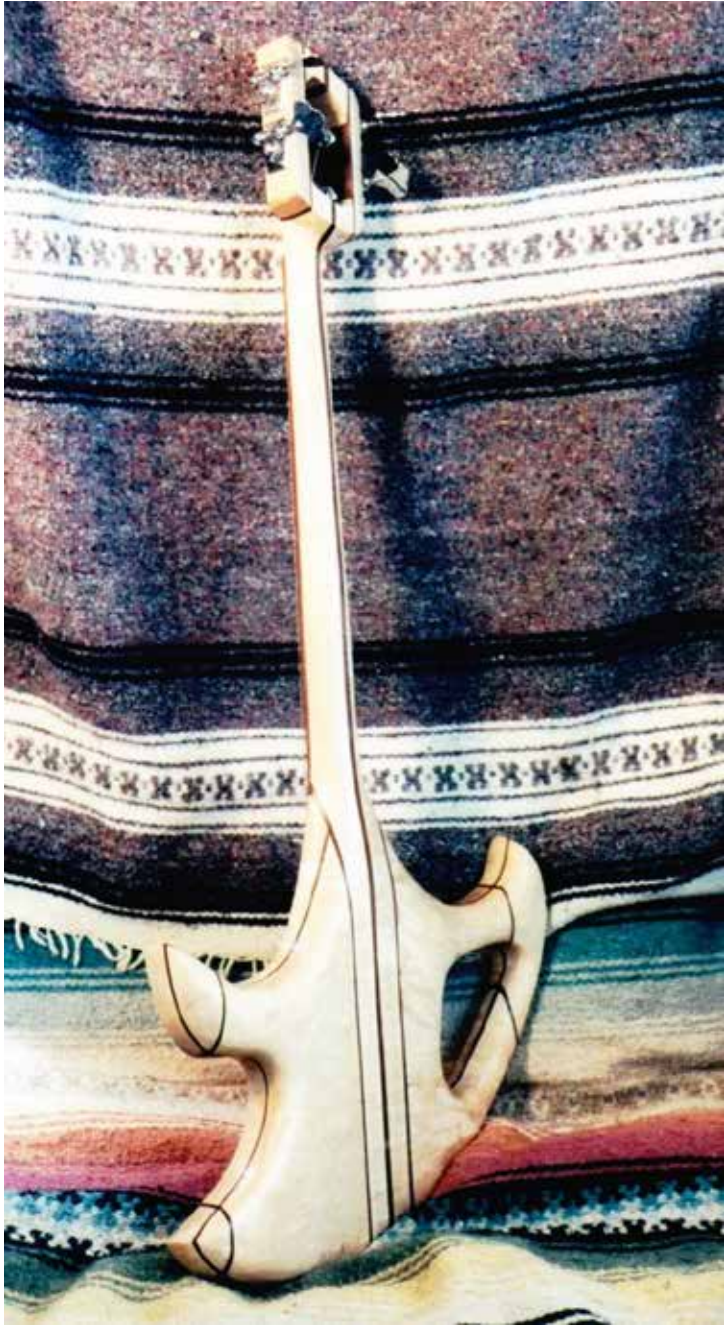
Curly Maple Mutant