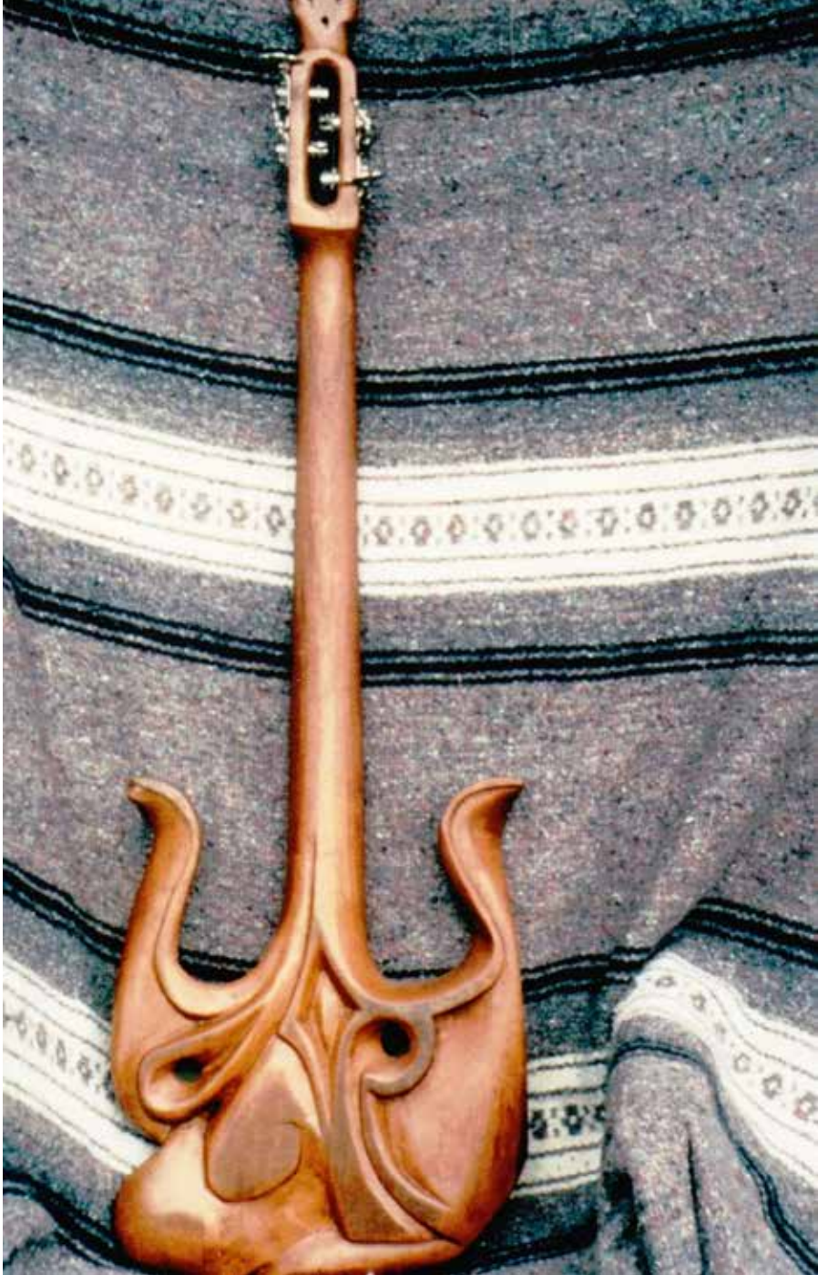
Ace of Diamonds Mahogany Bass