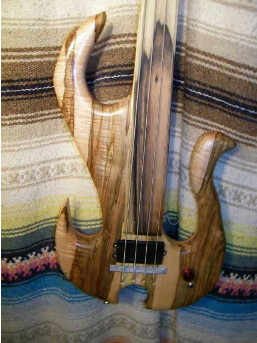
Ambrosia Maple Fantasy