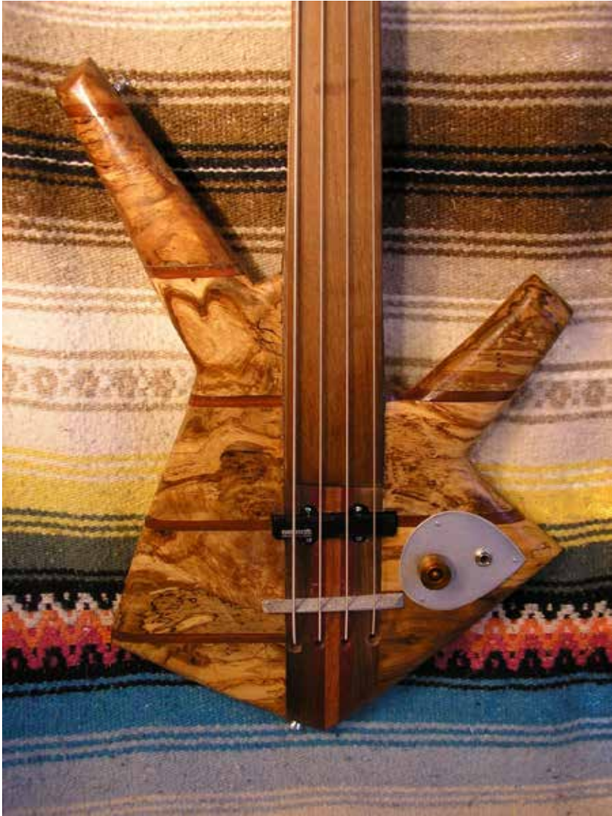
Ambrosia Maple Motley Cong Bass