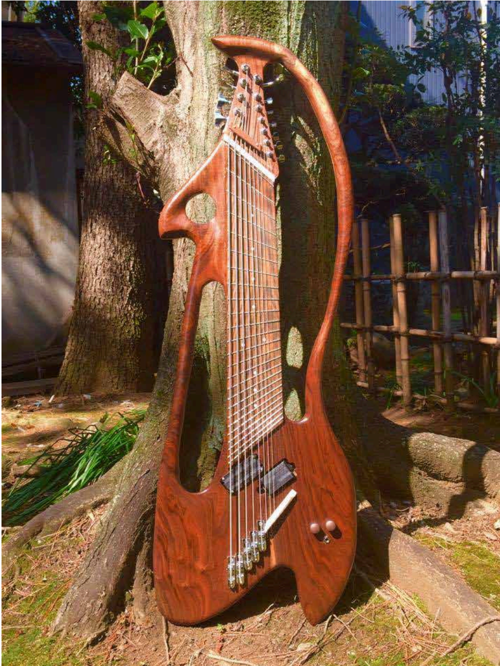
Eight String Tapping Guitar in Cherry