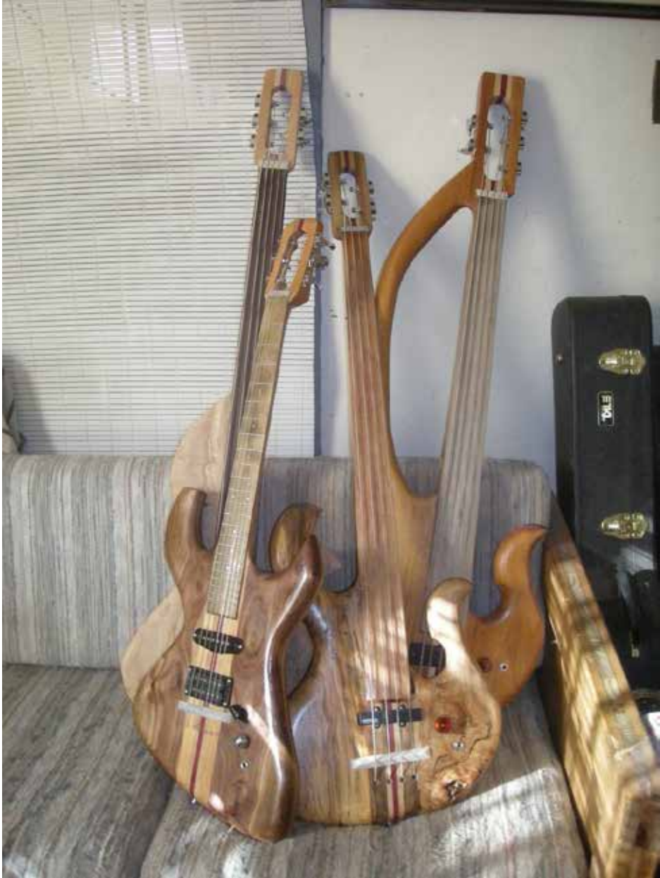
A Good Week's Work