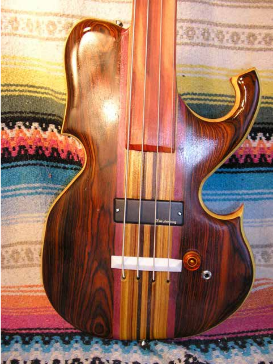
Rosewood Standard Bass