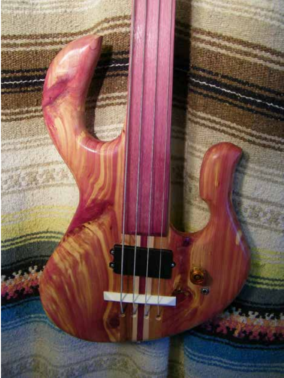
Red Cedar Stude