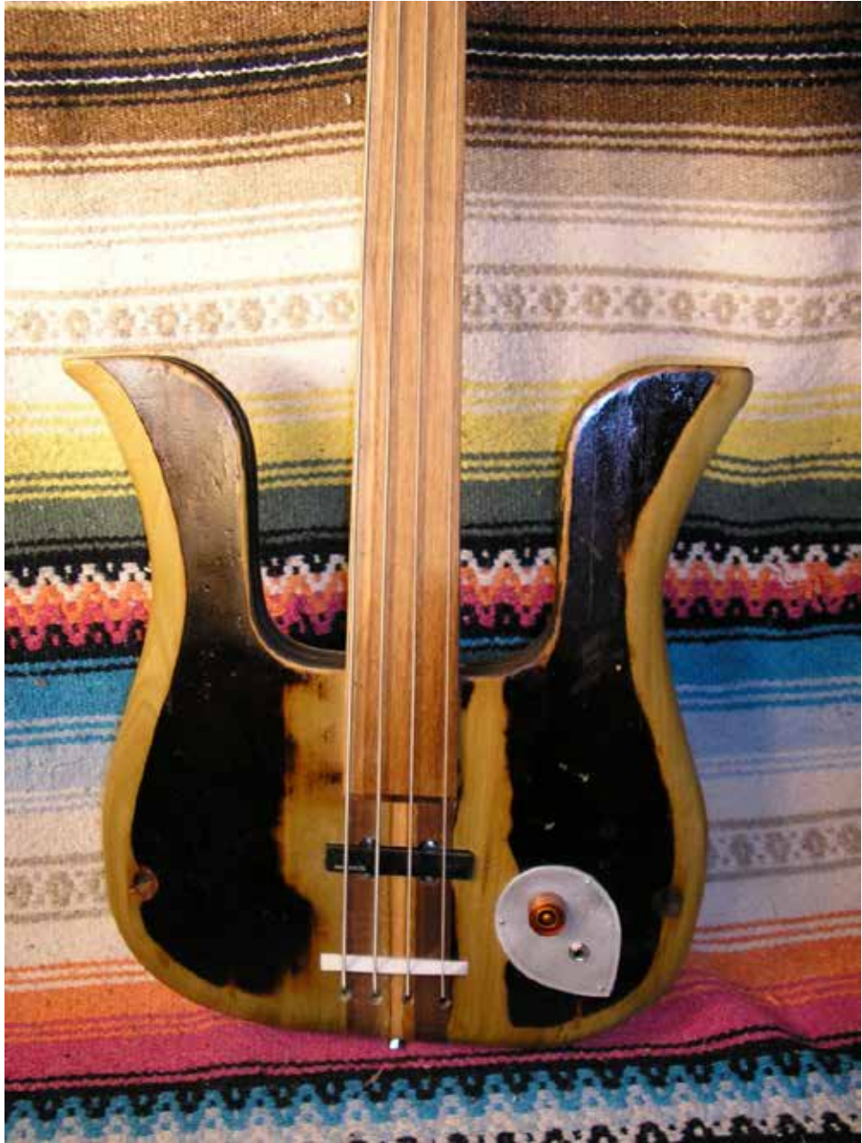
Piano Wood Longhorn Bass