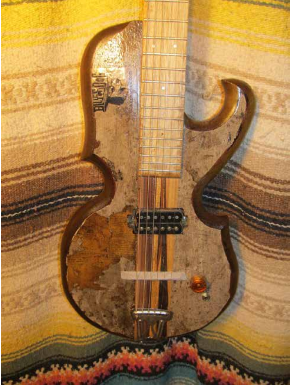
Old Growth Poplar with 1920's Newspaper Decoupage