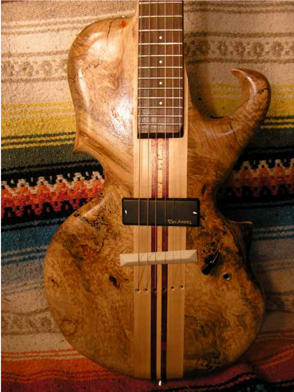
Very Gnarly Maple Standard Guitar