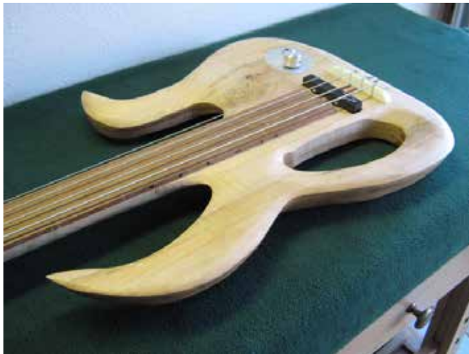
Very Early Wishbass Mutant