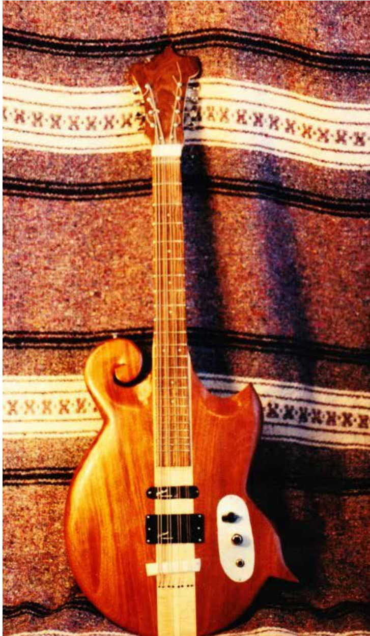
Mahogany Electric Mandocello