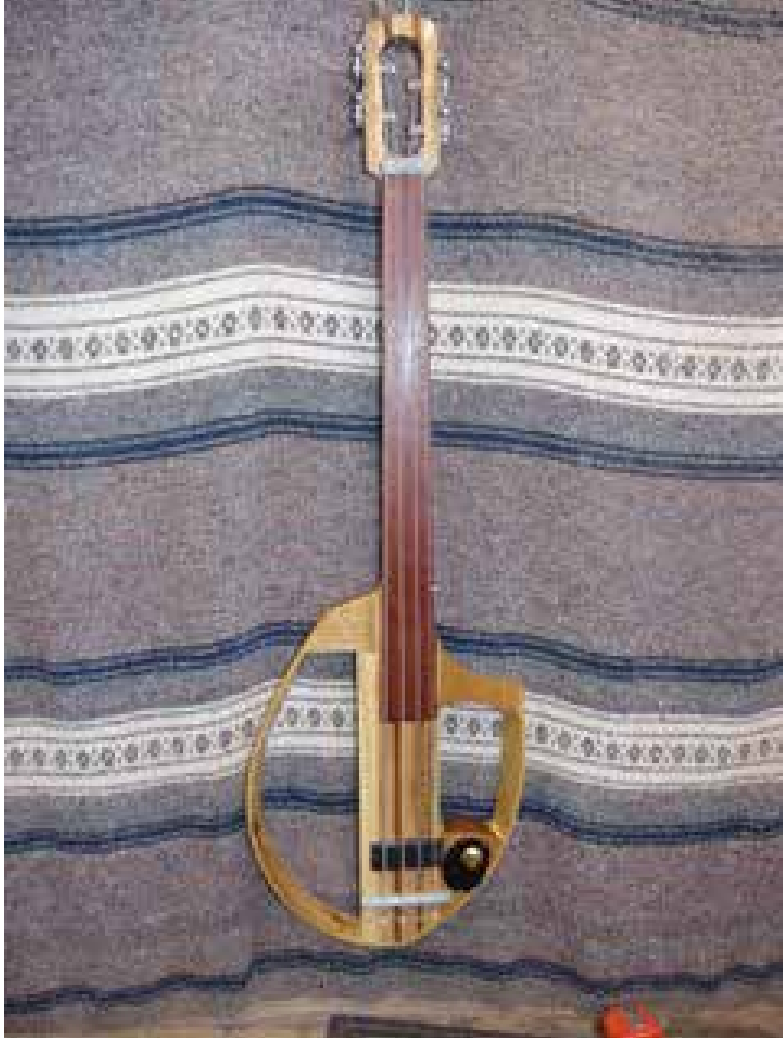
The Loop Bass