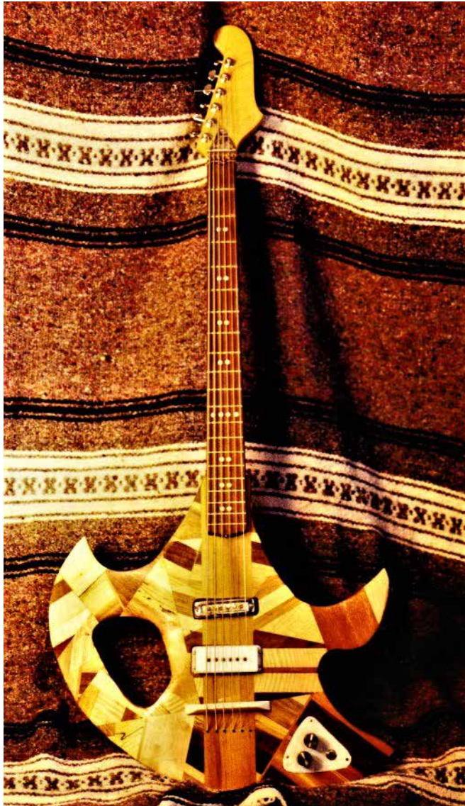
Motley Mutant Guitar