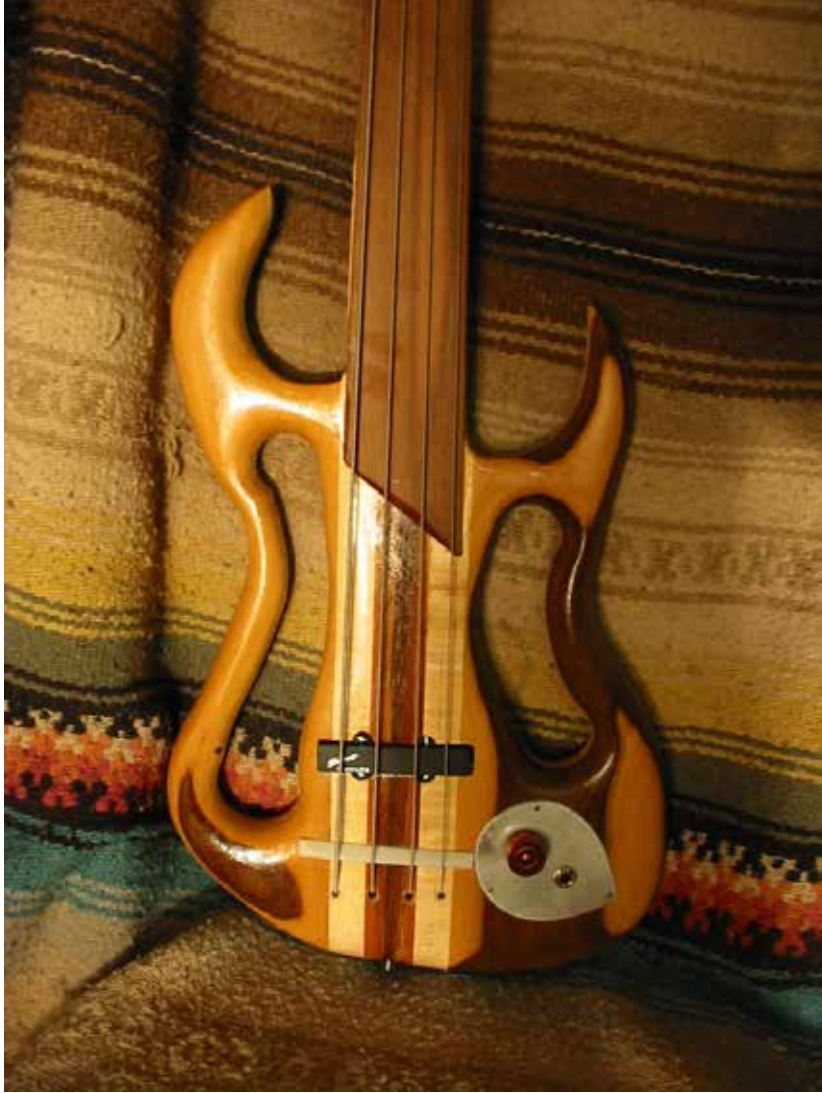
Piano Wood X-Normal Bass