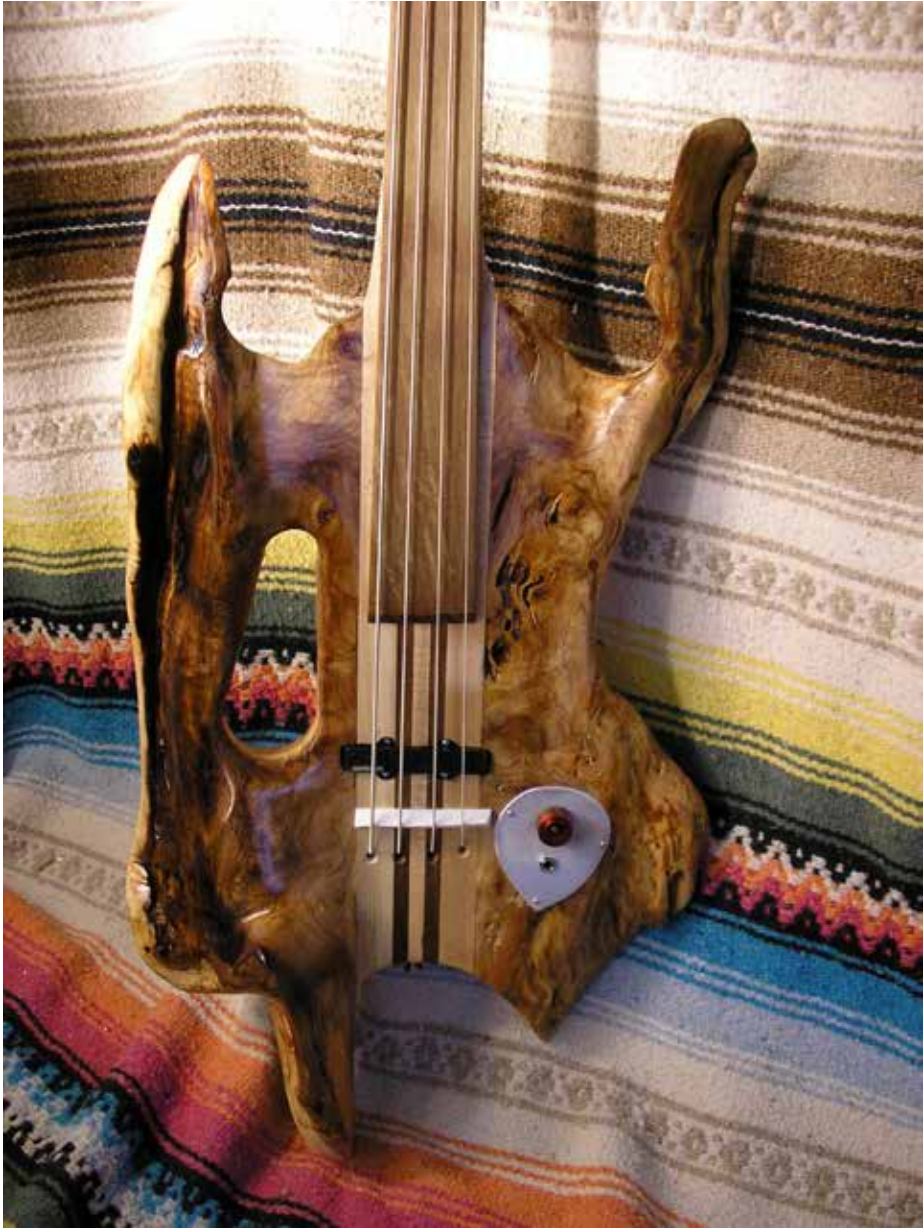
Maple Driftwood Bass