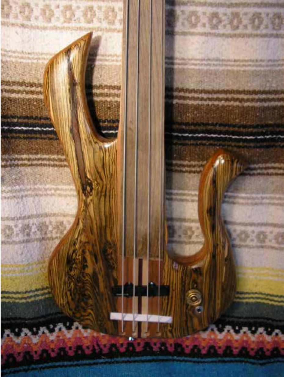
Zebrawood Peanut Variet