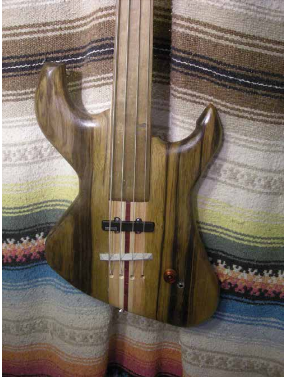
Old Growth Poplar Flare