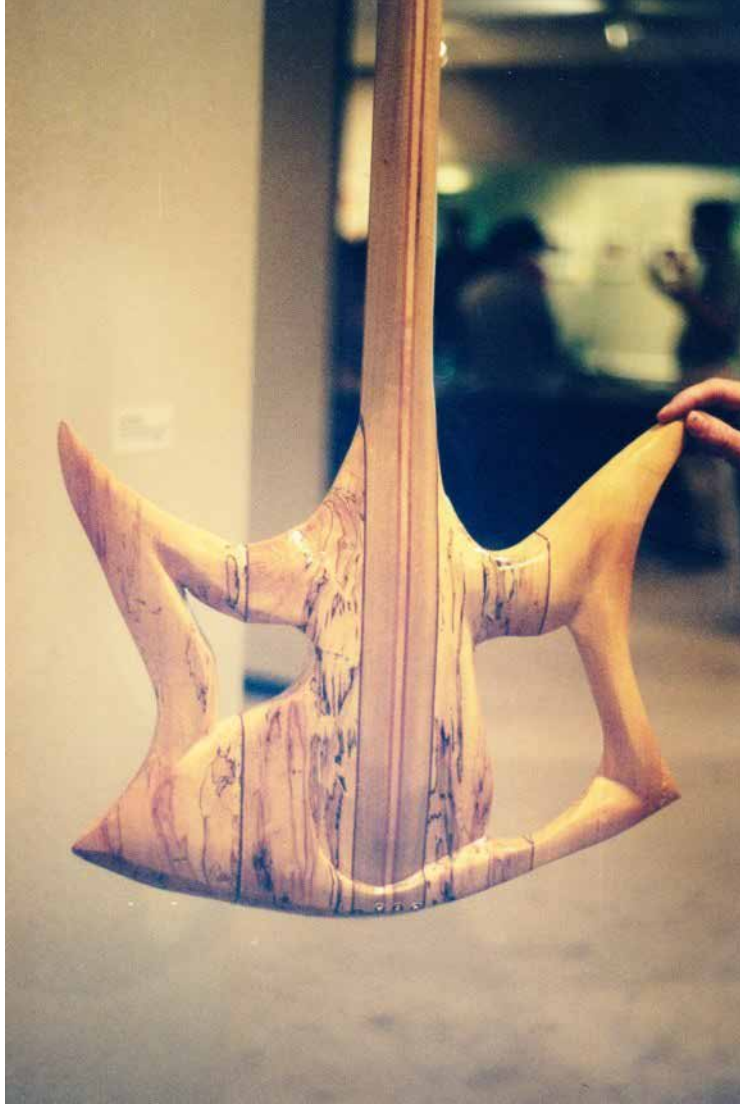
Ambrosia Maple Unique Bass