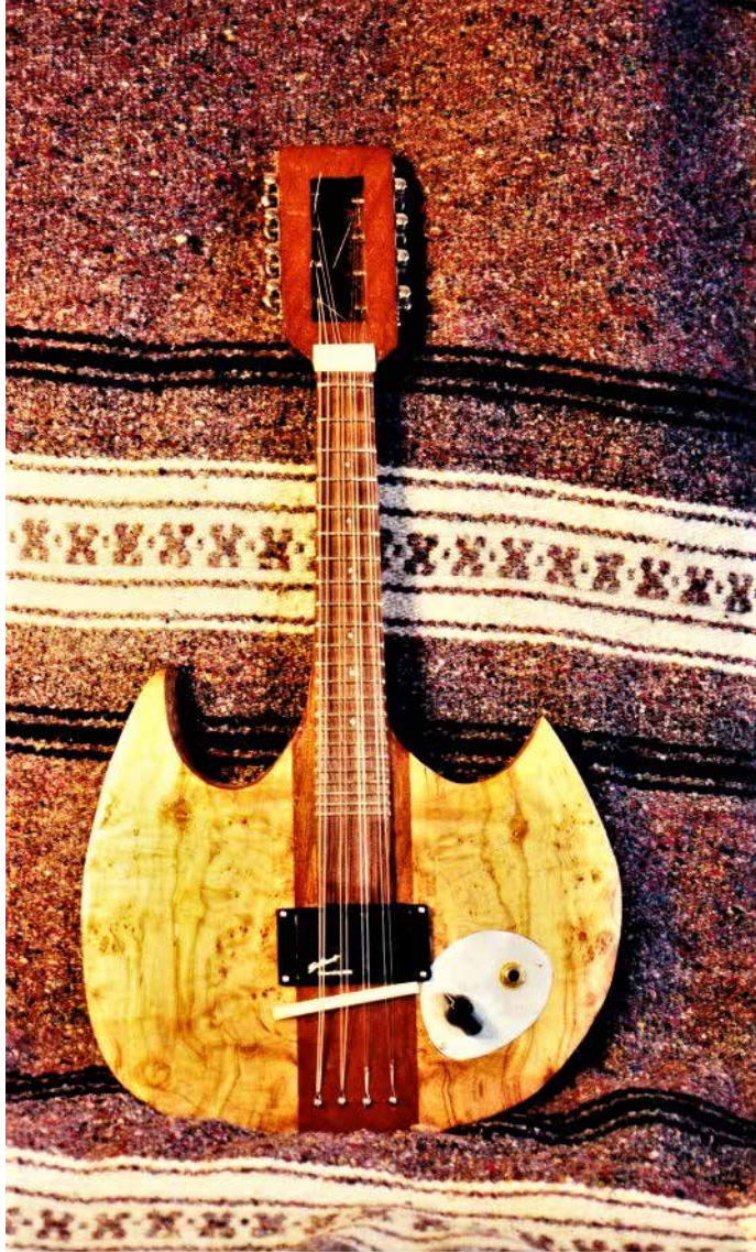
Birdseye Maple Electric Mandolin