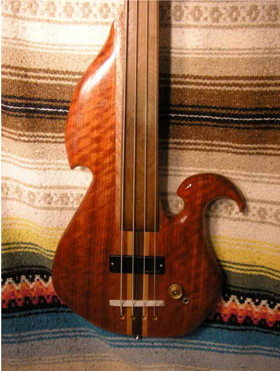
Curly Vermillion Arrow